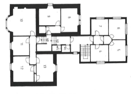
FIRST FLOOR LAYOUT PLAN