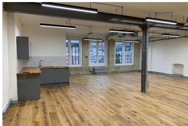
3 rd floor internal including kitchenette

https://my.matterport.com/show/?m=n4dHmejvt3a