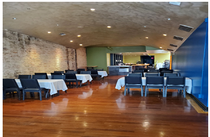
Second Floor Seating Area