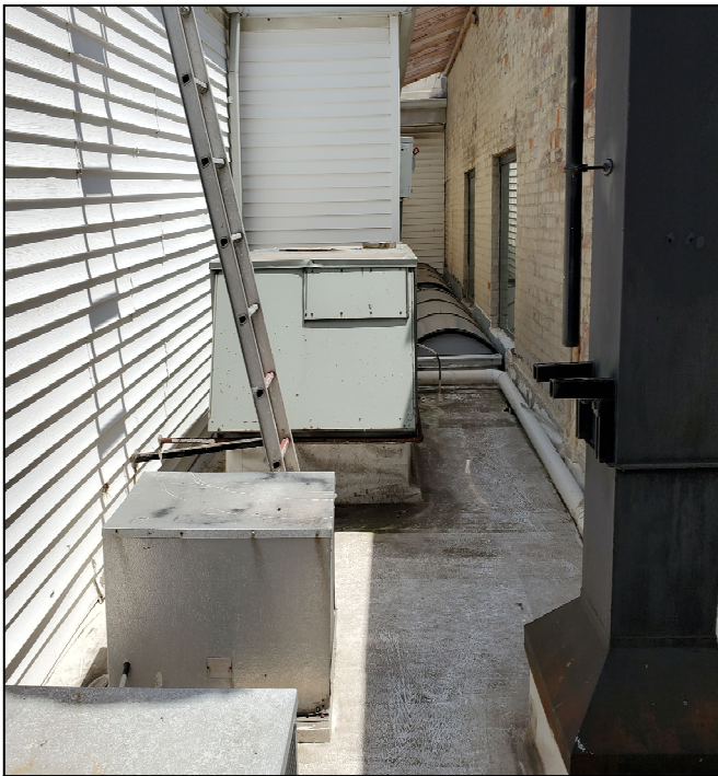
Easily Accessible Rooftop Area