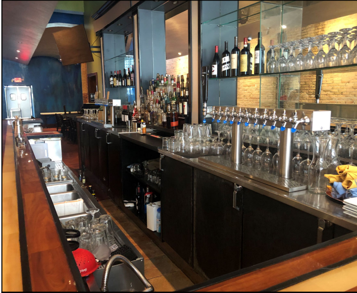
First Floor Bar Area