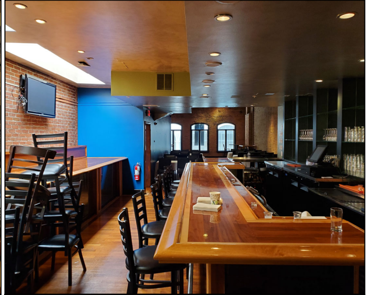
Second Floor Bar Area