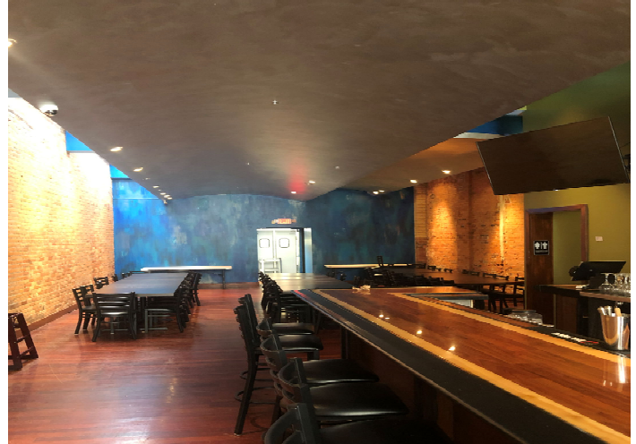
First Floor Seating Area