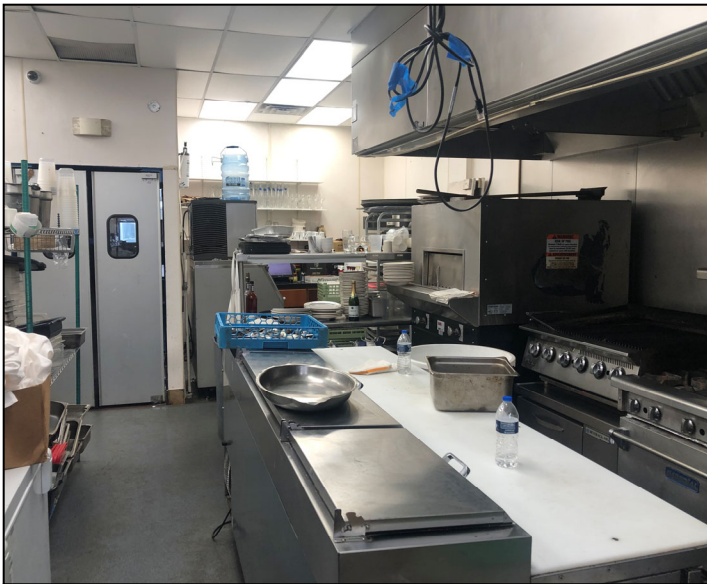
First Floor Kitchen