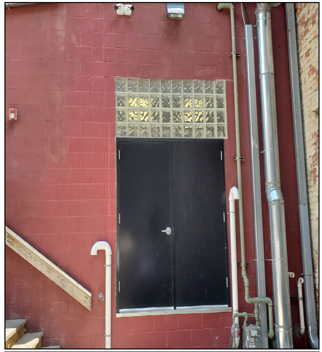
Rear Delivery Door