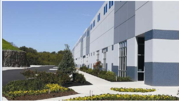
AmeriPlex at Elm Hill 330,000 SF