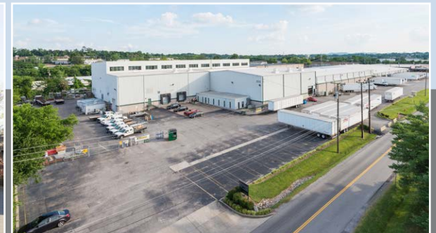
660 Massman 170,000 SF