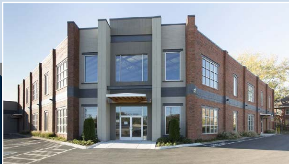
Bowtruss Germantown 40,000 SF