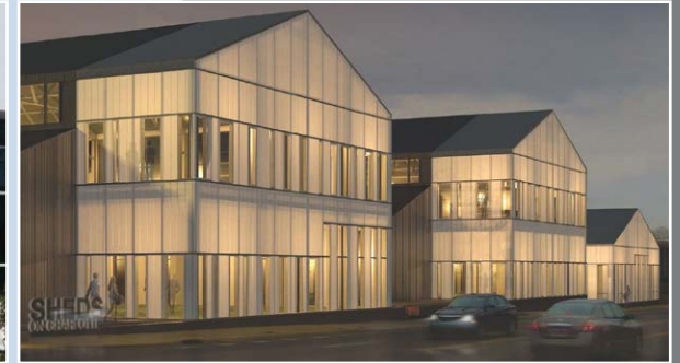
Sheds on Charlotte 90,000 SF