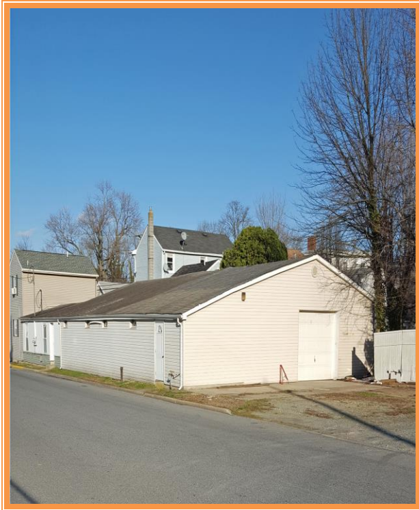
VIEW OF COMMERCIAL BUILDING