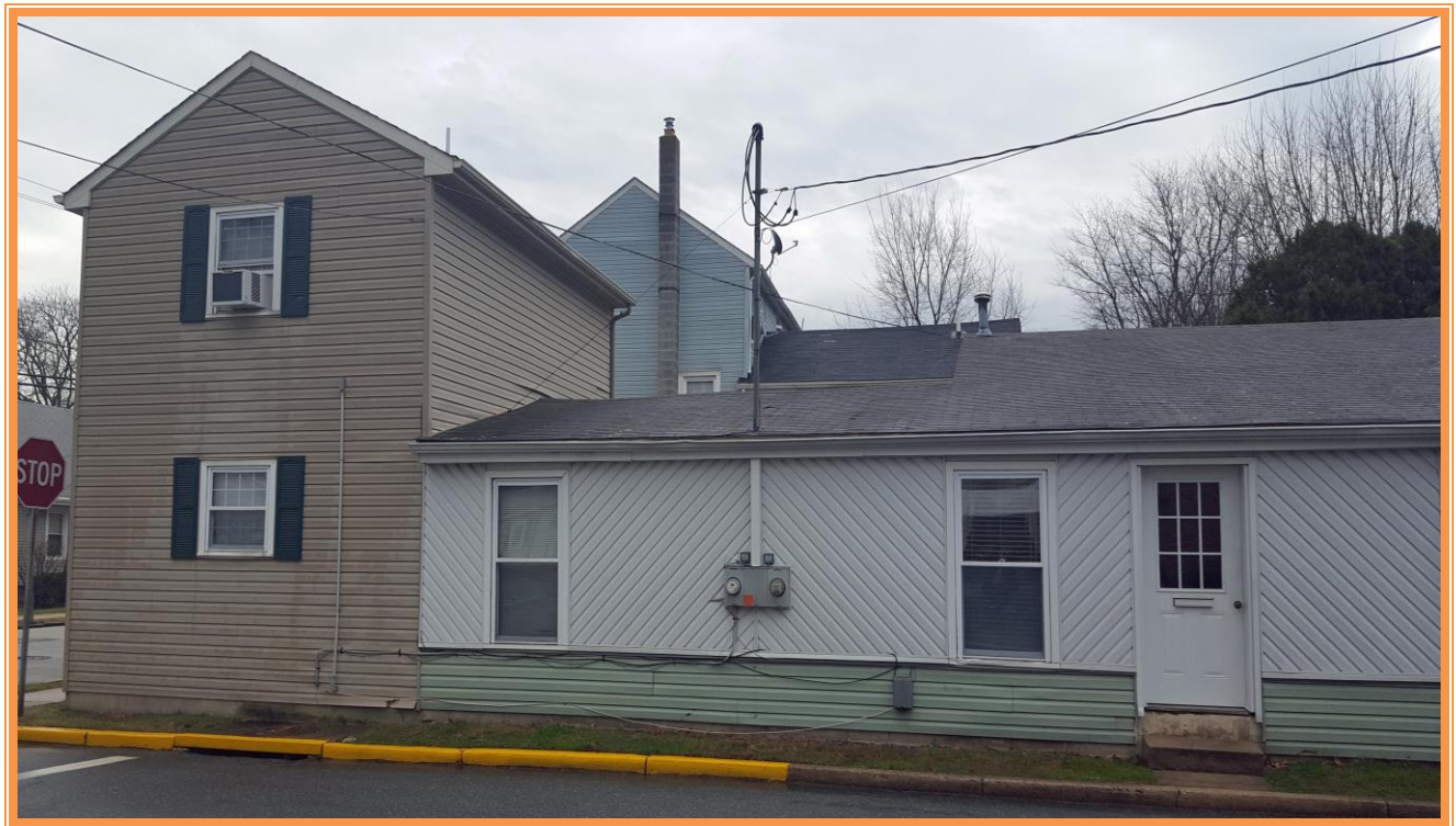
SIDE VIEW LOOKING SOUTH

ALL INFORMATION SUBMITTED SUBJECT TO ERRORS AND MODIFICATIONS. ALL INFORMATION CONTAINED HEREIN OBTAINED FROM RELIABLE SOURCES BUT NOT GUARANTEED. PROSPECTIVE PURCHASERS SHOULD VERIFY ALL INFORMATION SUBMITTED. LISTING BROKERAGE REPRESENTS SELLER. PAGE 2 OF 3 PAGES