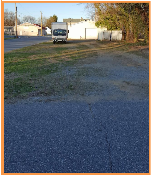
VIEW OF ATTACHED YARD