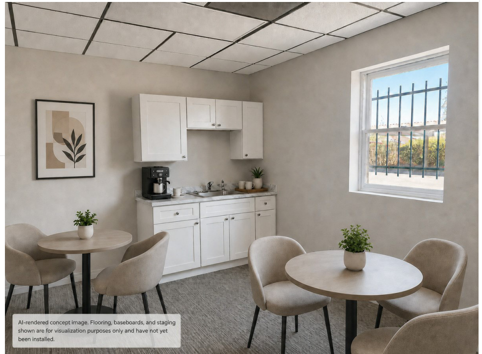
AI-rendered concept image. Flooring, baseboards, and staging shown are for visualization purposes only and have not yet been installed.