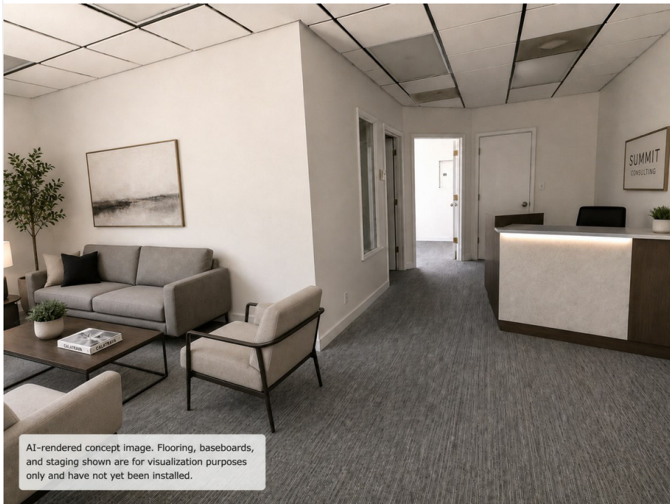
AI-rendered concept image. Flooring, baseboards, and staging shown are for visualization purposes only and have not yet been installed.