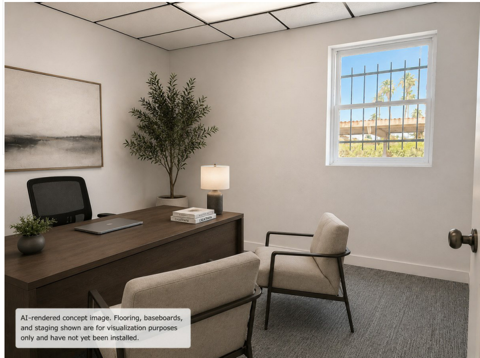
AI-rendered concept image. Flooring, baseboards, and staging shown are for visualization purposes only and have not yet been installed.