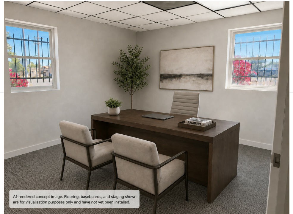
AI-rendered concept image. Flooring, baseboards, and staging shown are for visualization purposes only and have not yet been installed.