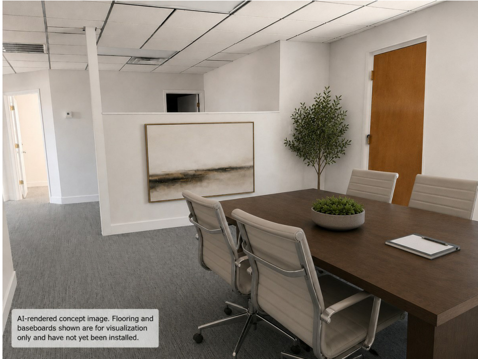
AI-rendered concept image. Flooring and baseboards shown are for visualization only and have not yet been installed.