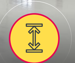
6.78 METRES TO EAVES