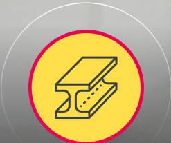
STEEL PORTAL FRAME CONSTRUCTION