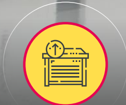
LEVEL ACCESS LOADING DOOR