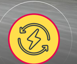
69 KVA POWER CAPACITY