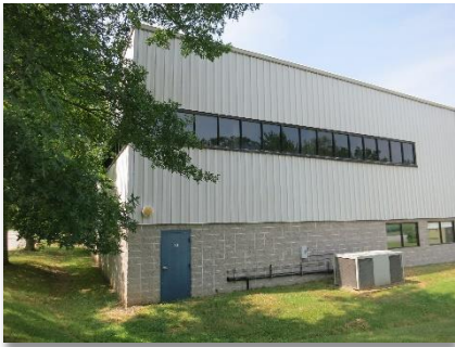
Exterior View of Office Area