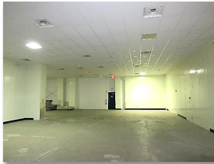
Air-Conditioned Production/Storage Area