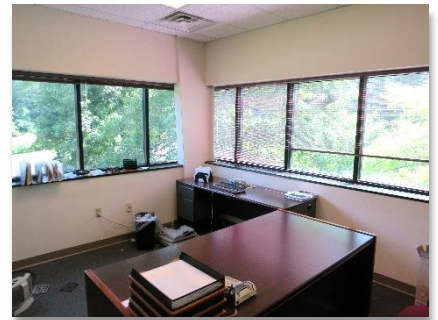
View of Typical Private Office