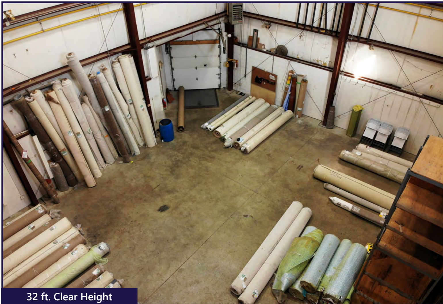
32 ft. Clear Height