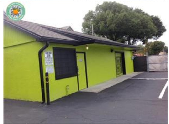
2422 E ROBINSON ST, ORLANDO, FL 32803 11/15/2016 10:49 AM

Two separate buildings available. The combined space for both buildings is 2929 Sq ft. Both units have central A/C. The property is ADA compliant. The building has security shutters on both doors and windows. There are 4 parking spots available on site. There is additional public parking available around the building.