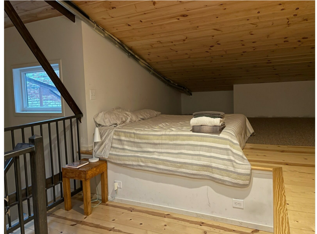
747 1/2 Columbia St - 2+ Bedroom - Unit 2