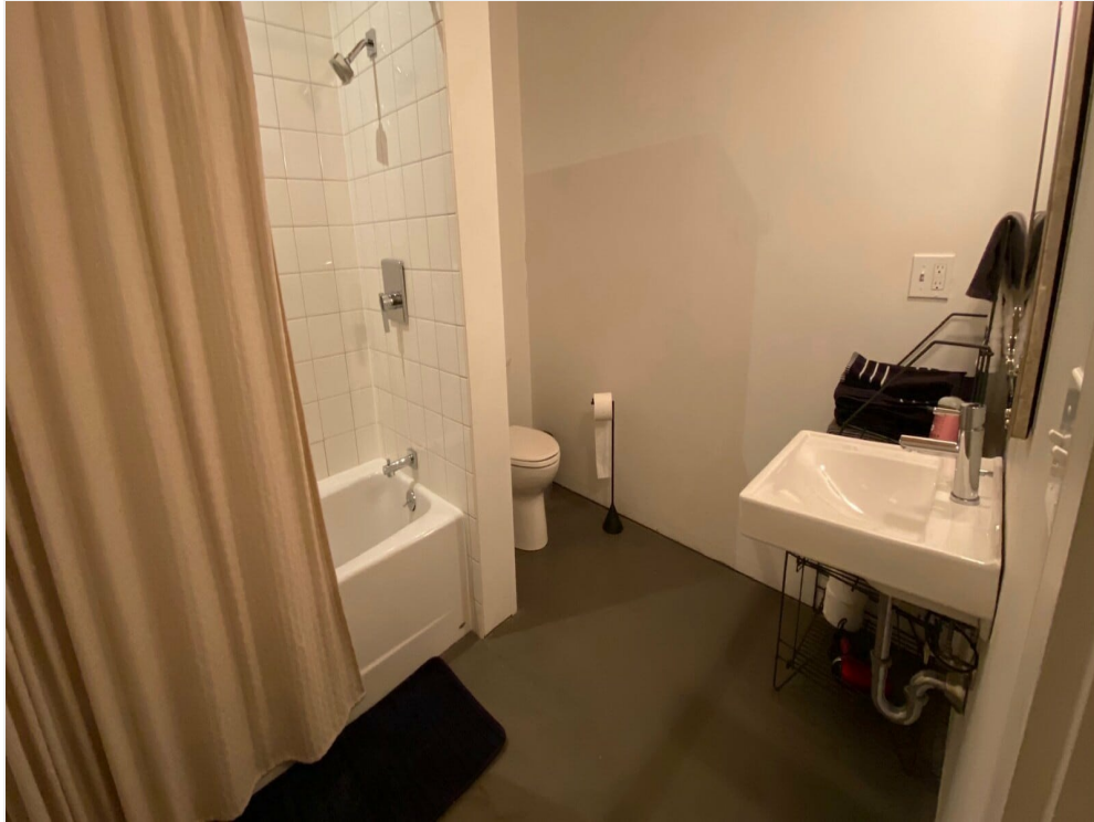
747 1/2 Columbia St - Studio - Unit 1