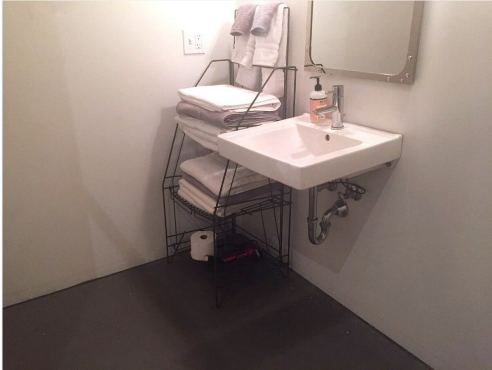
747 1/2 Columbia St - Studio - Unit 1