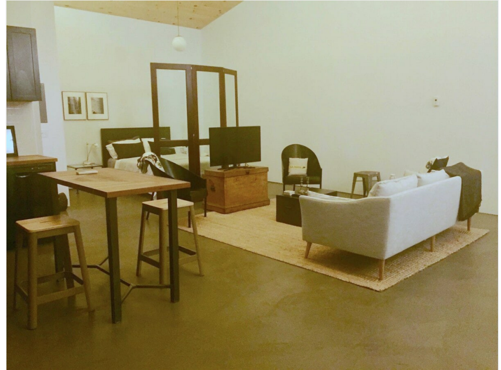
747 1/2 Columbia St - Studio - Unit 1