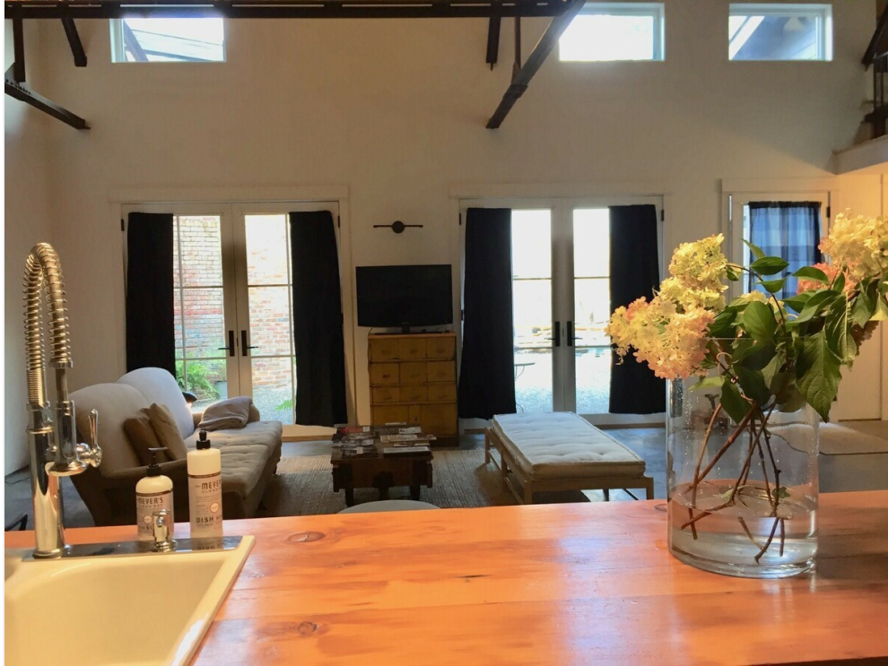
747 1/2 Columbia St - 2+ Bedroom - Unit 2