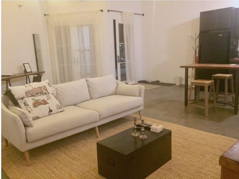
747 1/2 Columbia St - Studio - Unit 1