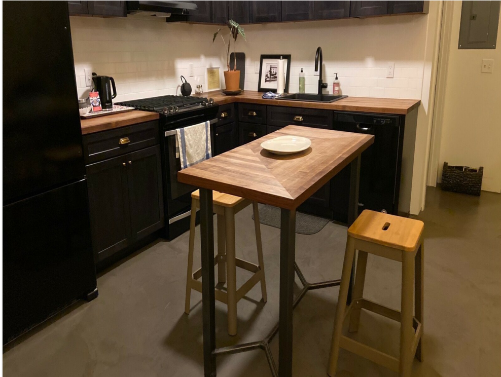
747 1/2 Columbia St - Studio - Unit 1