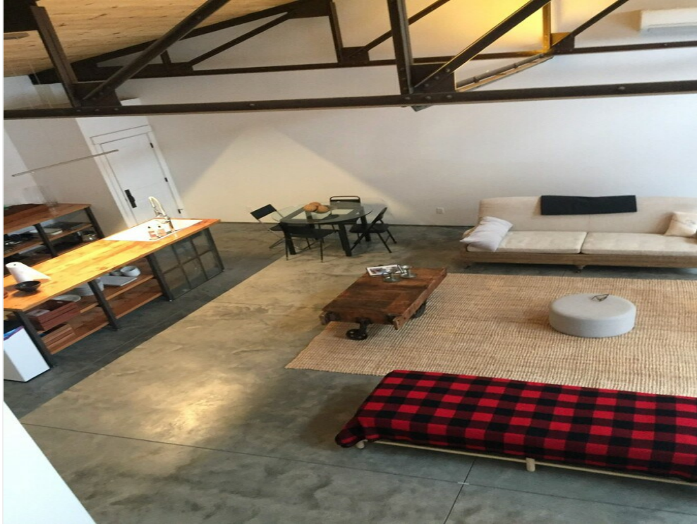
747 1/2 Columbia St - 2+ Bedroom - Unit 2