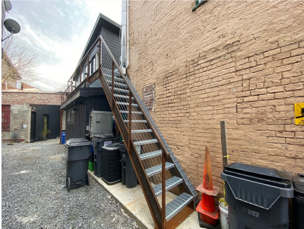
747 Columbia - Stairs to Studio Apt