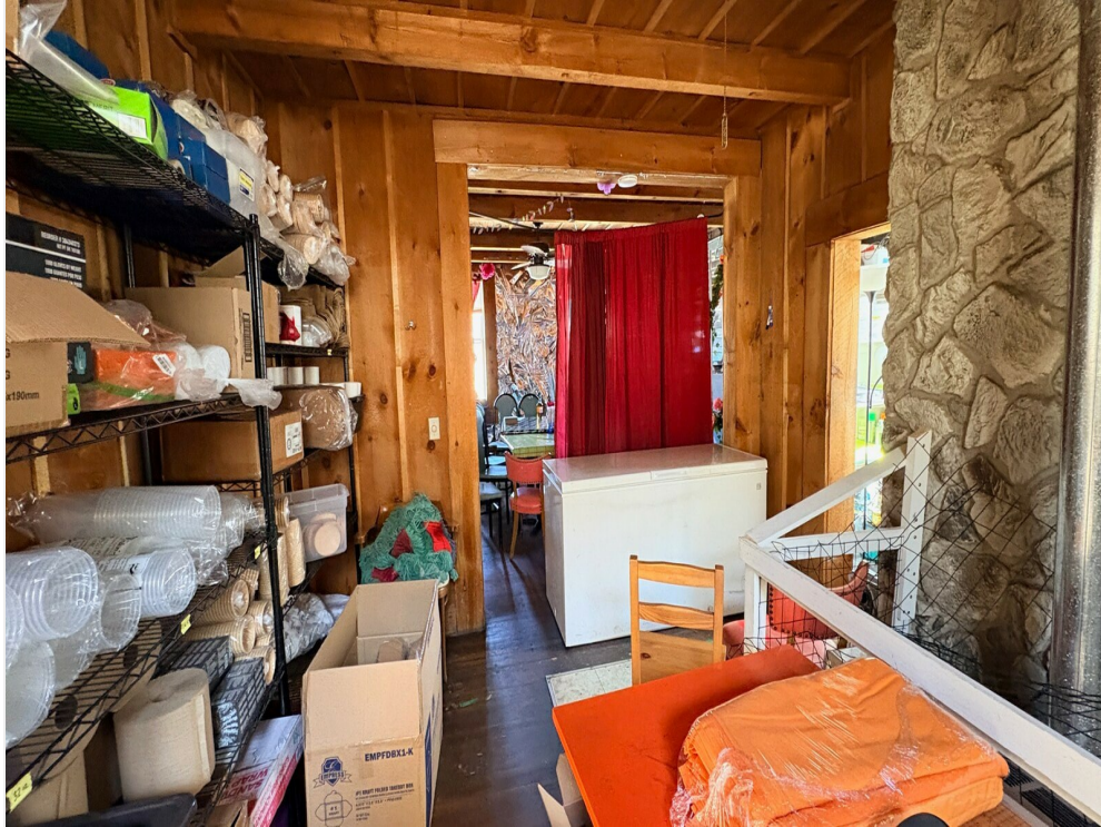
747 Columbia St - 2nd Fl - Storage