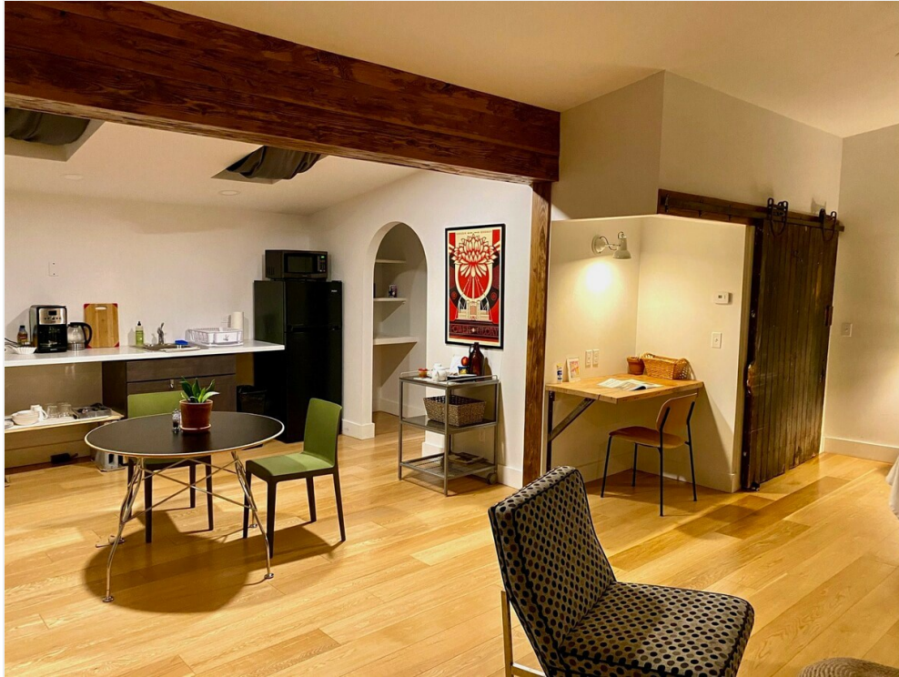
747 Columbia St - Studio Apartment