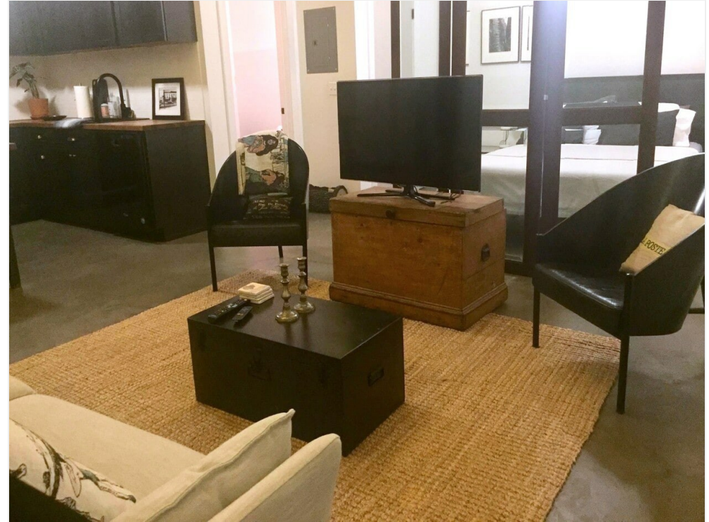
747 1/2 Columbia St - Studio - Unit 1