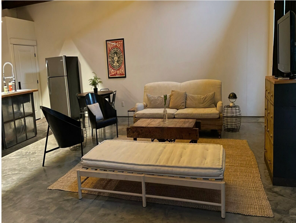
747 1/2 Columbia St - 2+ Bedroom - Unit 2