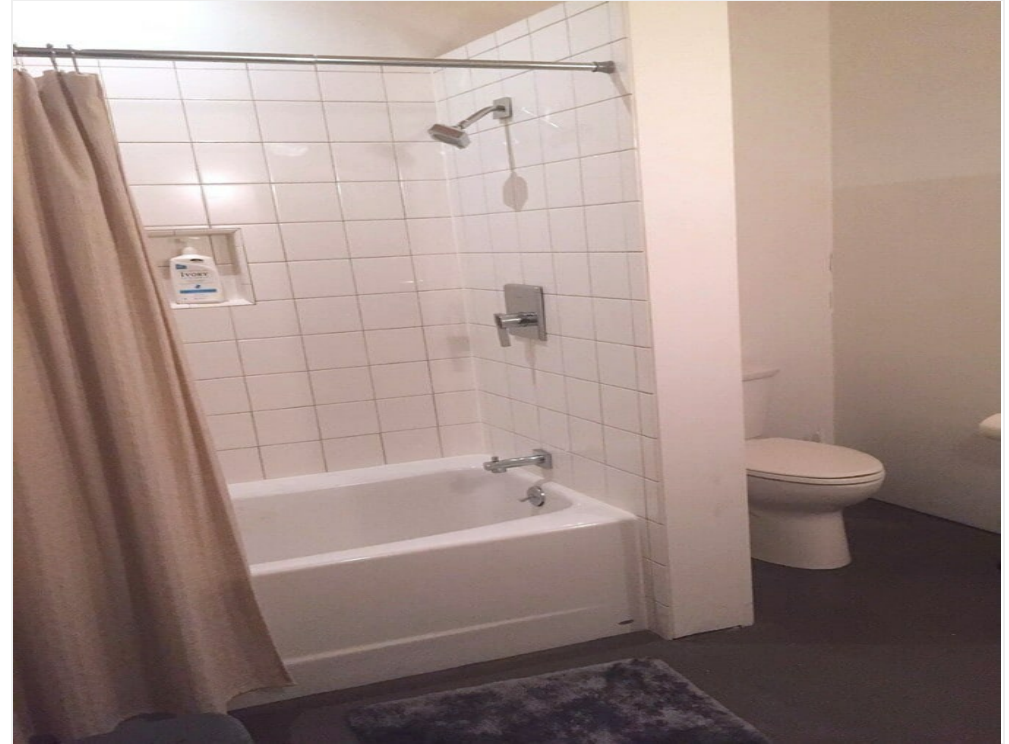
747 1/2 Columbia St - Studio - Unit 1