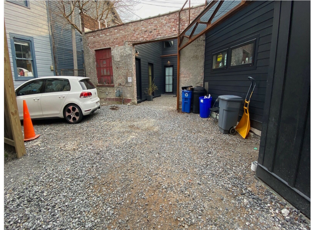
747 1/2 Columbia St Front Courtyard