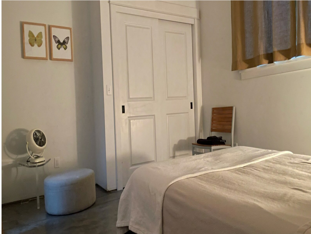
747 1/2 Columbia St - 2+ Bedroom - Unit 2