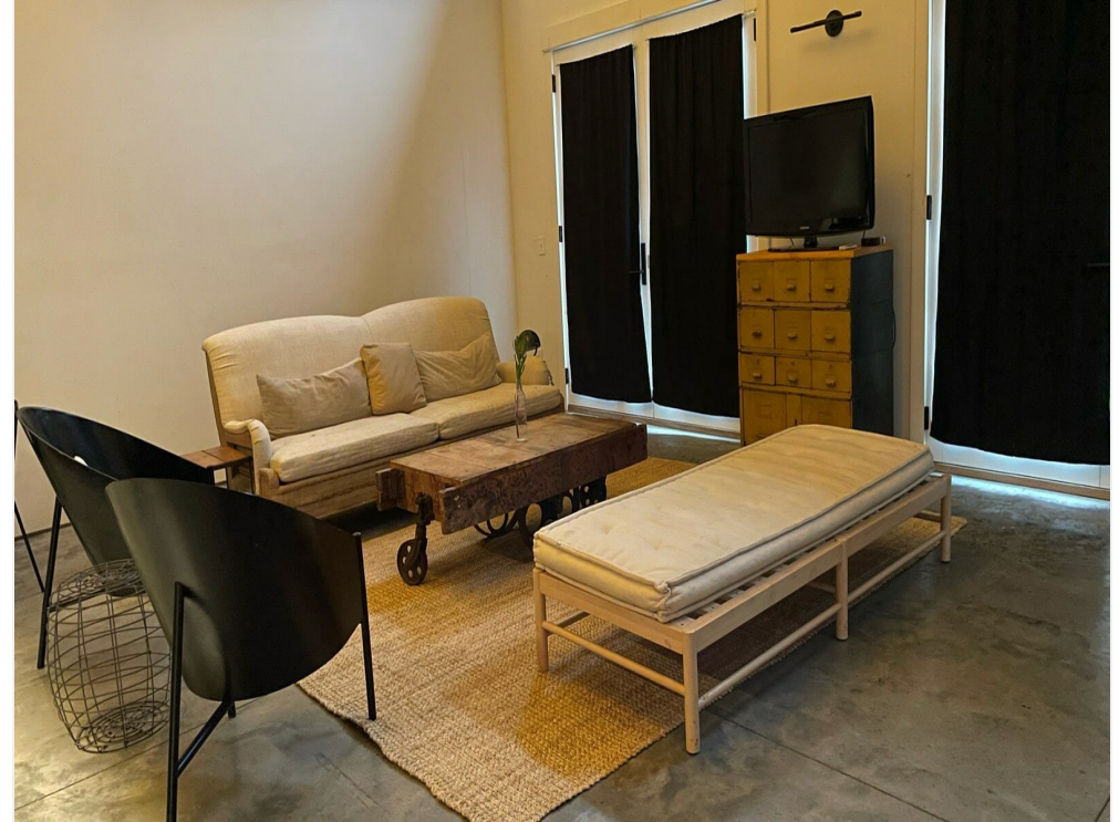
747 1/2 Columbia St - 2+ Bedroom - Unit 2