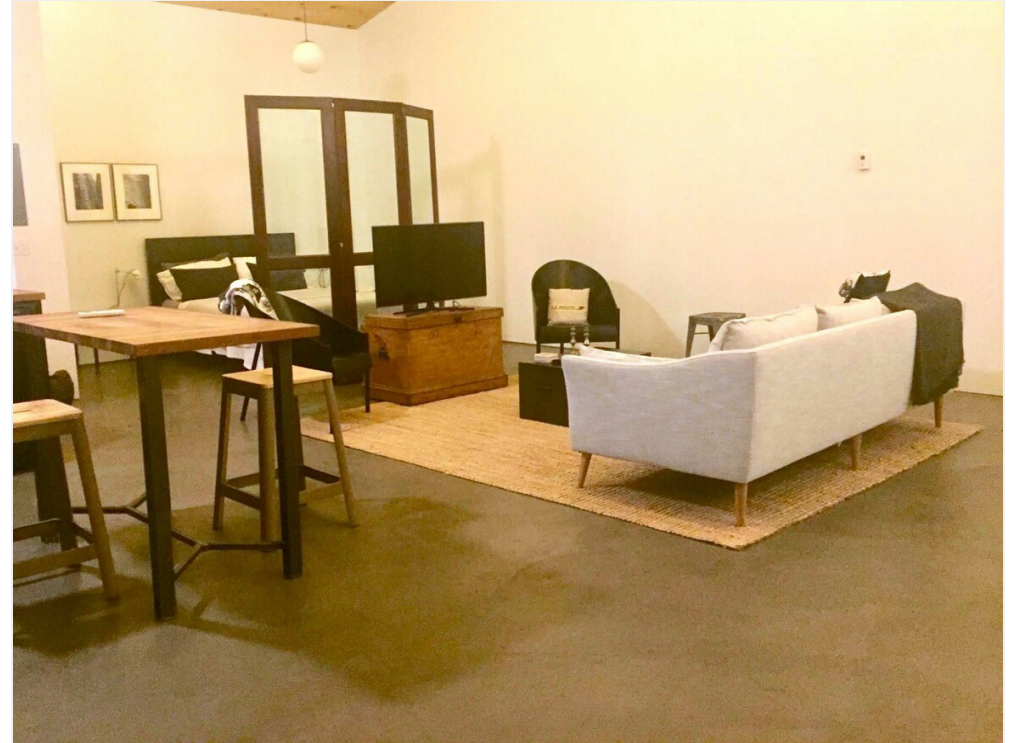
747 1/2 Columbia St - Studio - Unit 1