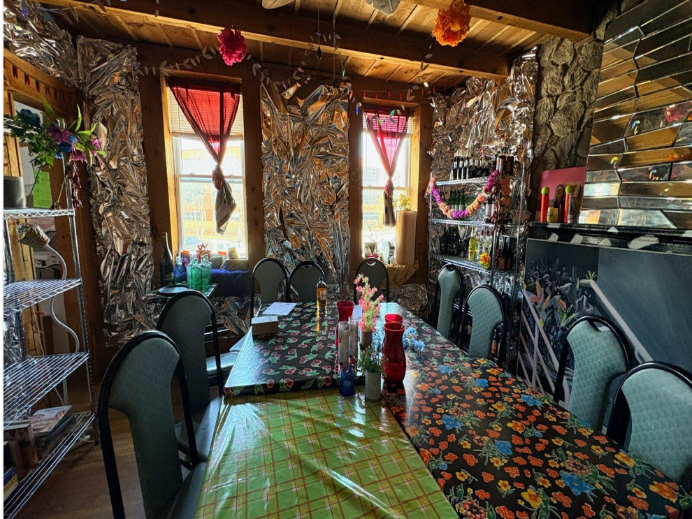
747 Columbia St - 2nd Fl - Private Dining Room