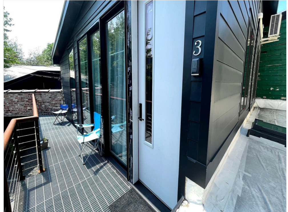
747 Columbia Entry to Studio Apt