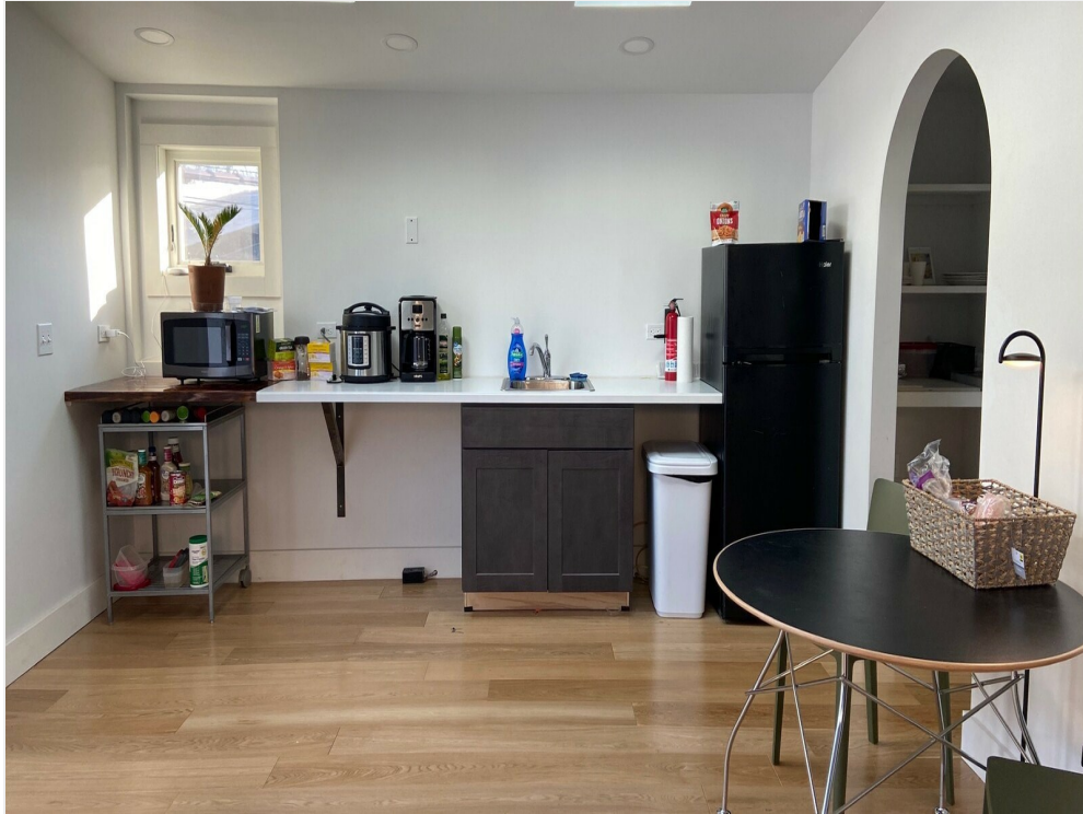
747 Columbia St - Studio Apartment