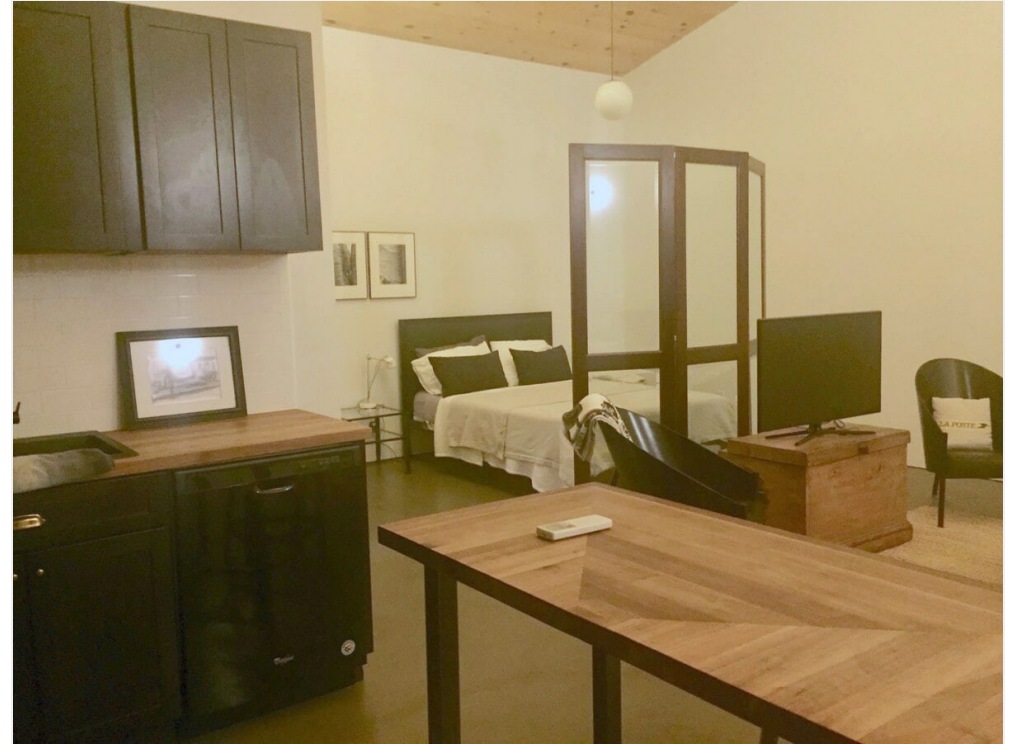
747 1/2 Columbia St - Studio - Unit 1