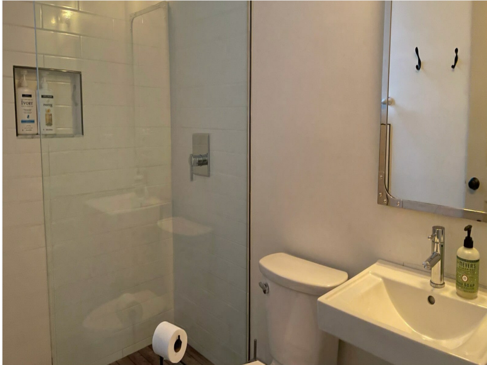
747 1/2 Columbia St - 2+ Bedroom - Unit 2