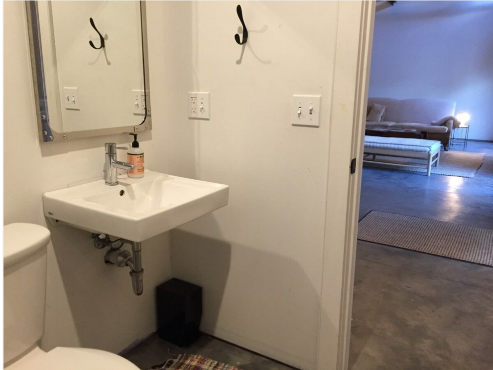
747 1/2 Columbia St - 2+ Bedroom - Unit 2