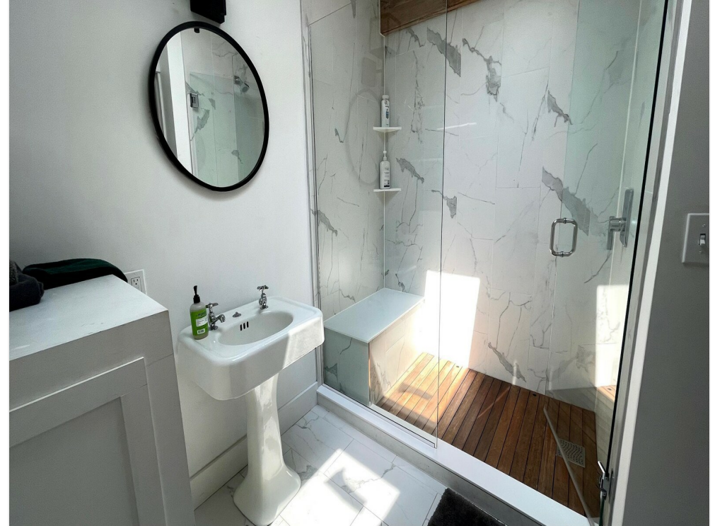
747 Columbia St - Studio Apartment