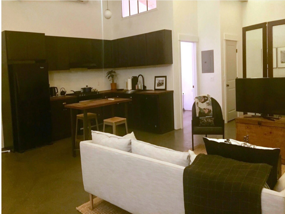
747 1/2 Columbia St - Studio - Unit 1