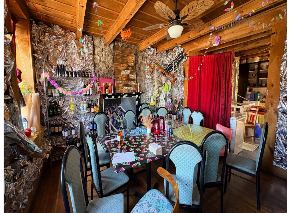
747 Columbia St - 2nd Fl - Private Dining Room