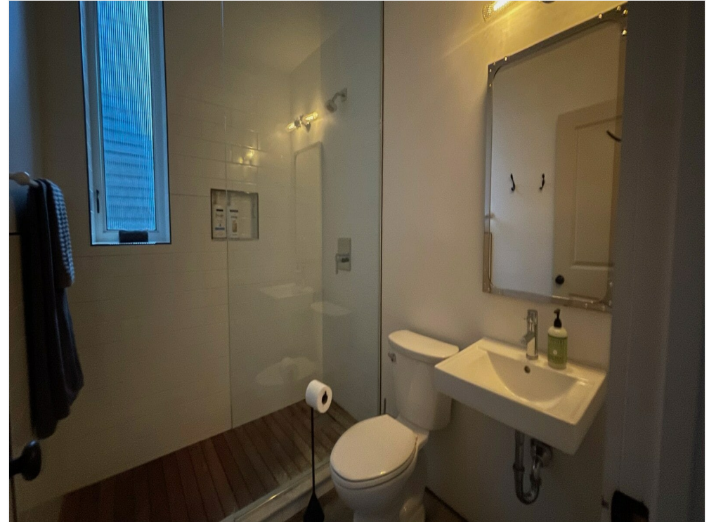
747 1/2 Columbia St - 2+ Bedroom - Unit 2