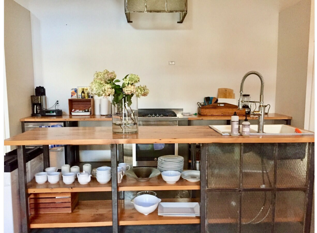
747 1/2 Columbia St - 2+ Bedroom - Unit 2