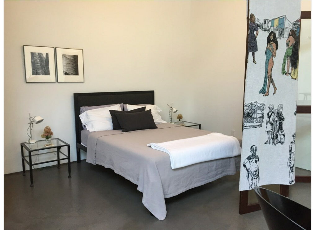
747 1/2 Columbia St - Studio - Unit 1