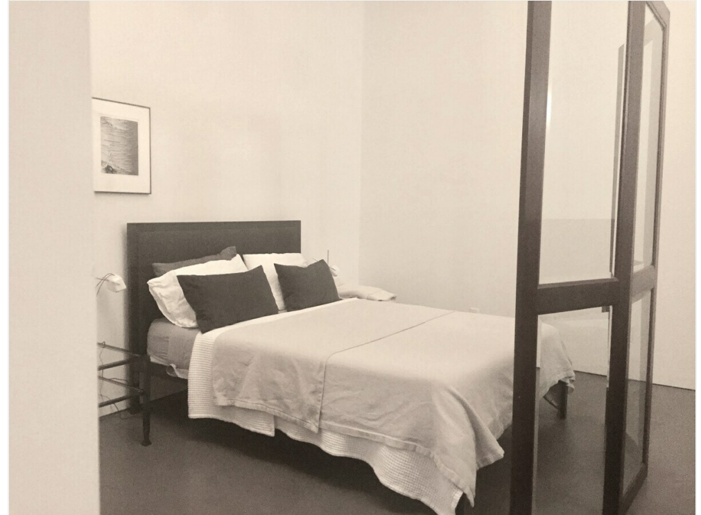
747 1/2 Columbia St - Studio - Unit 1