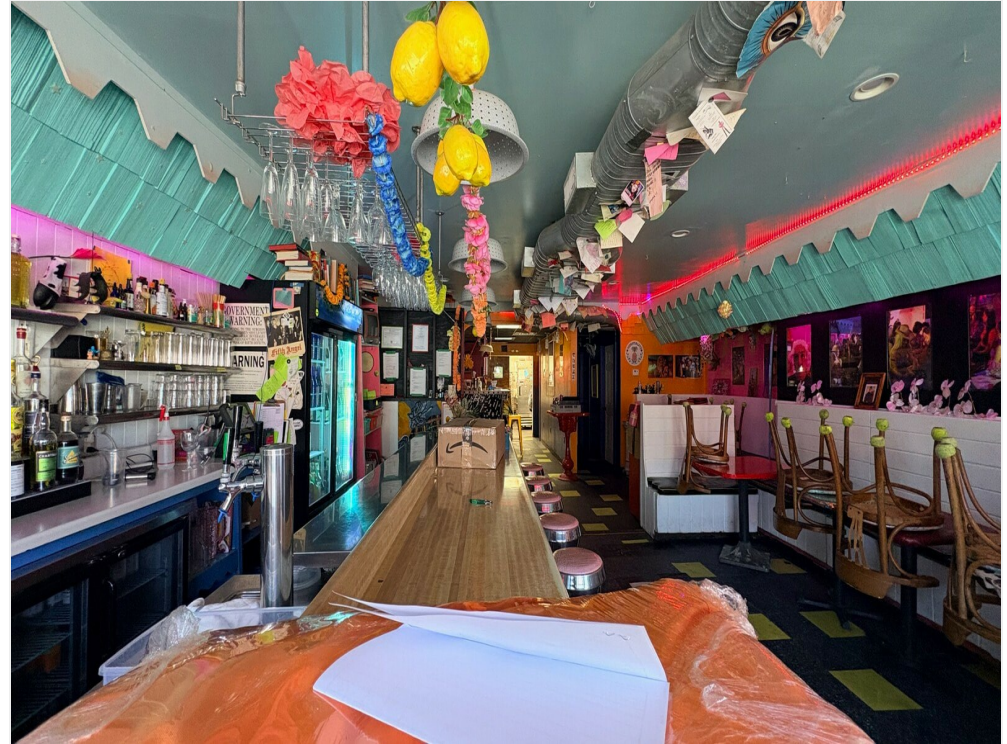
747 Columbia St - Dining Room