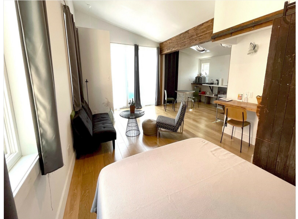
747 Columbia St