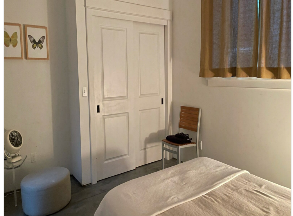
747 1/2 Columbia St - 2+ Bedroom - Unit 2