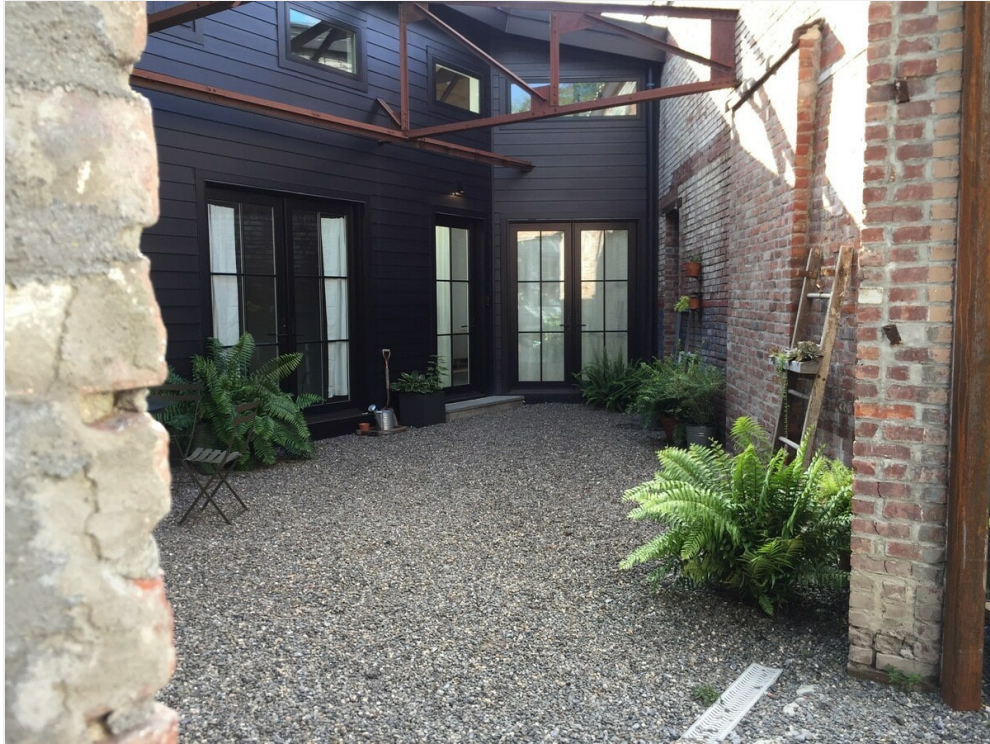
747 1/2 Columbia St - Rear Courtyard