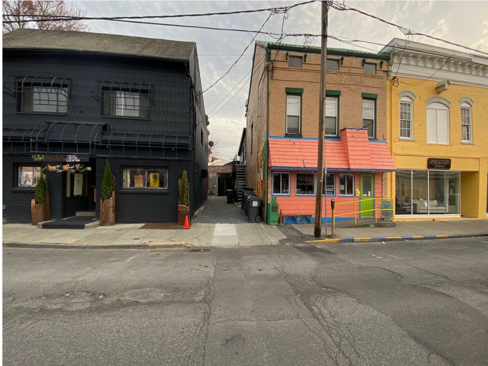
747 Columbia St Exterior