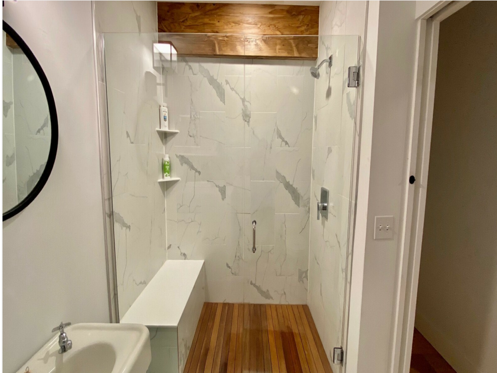
747 Columbia St - Studio Apartment