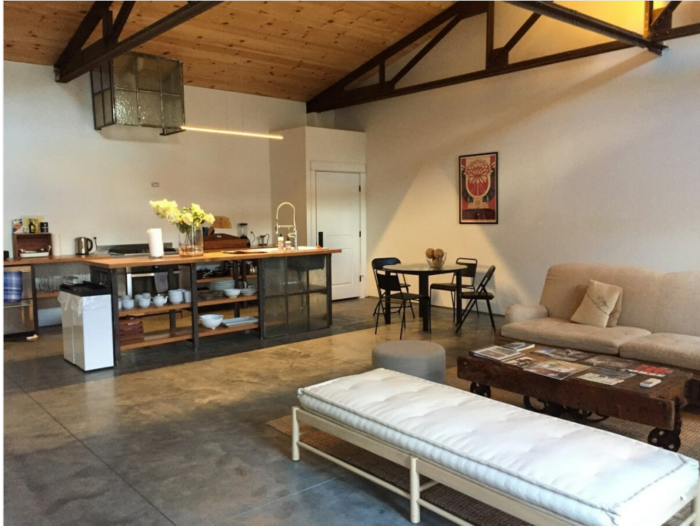
747 1/2 Columbia St - 2+ Bedroom - Unit 2