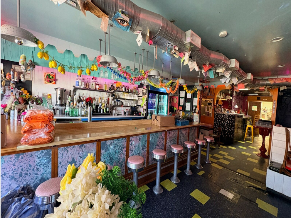
747 Columbia St - Dining Room