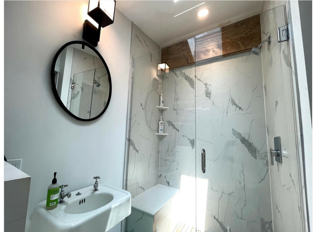
747 Columbia St - Studio Apartment