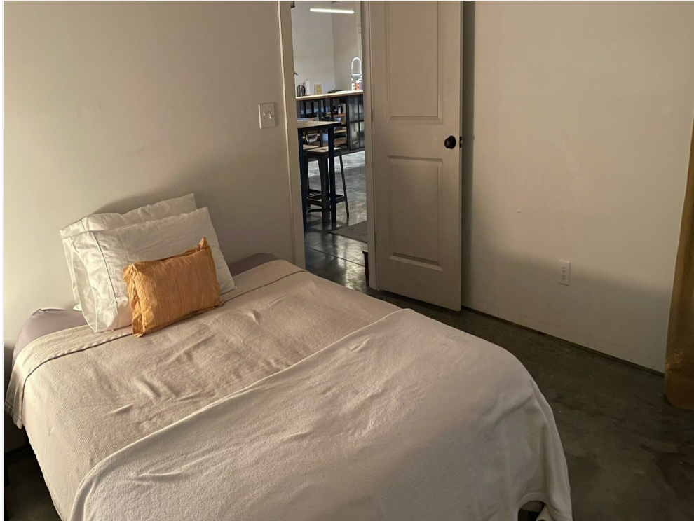
747 1/2 Columbia St - 2+ Bedroom - Unit 2