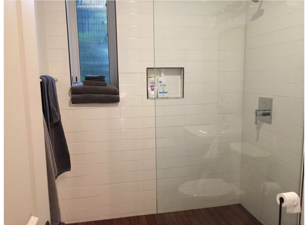
747 1/2 Columbia St - 2+ Bedroom - Unit 2