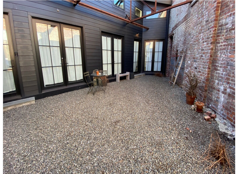
747 1/2 Columbia St - Rear Courtyard