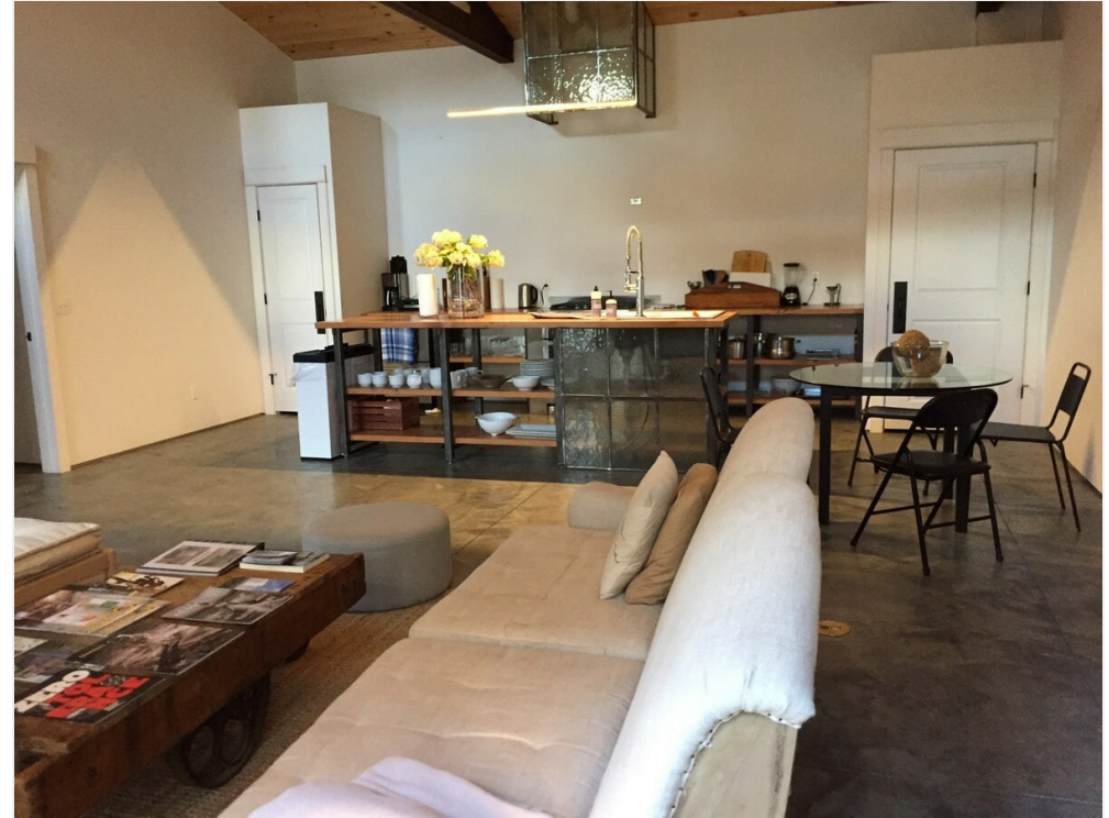
747 1/2 Columbia St - 2+ Bedroom - Unit 2