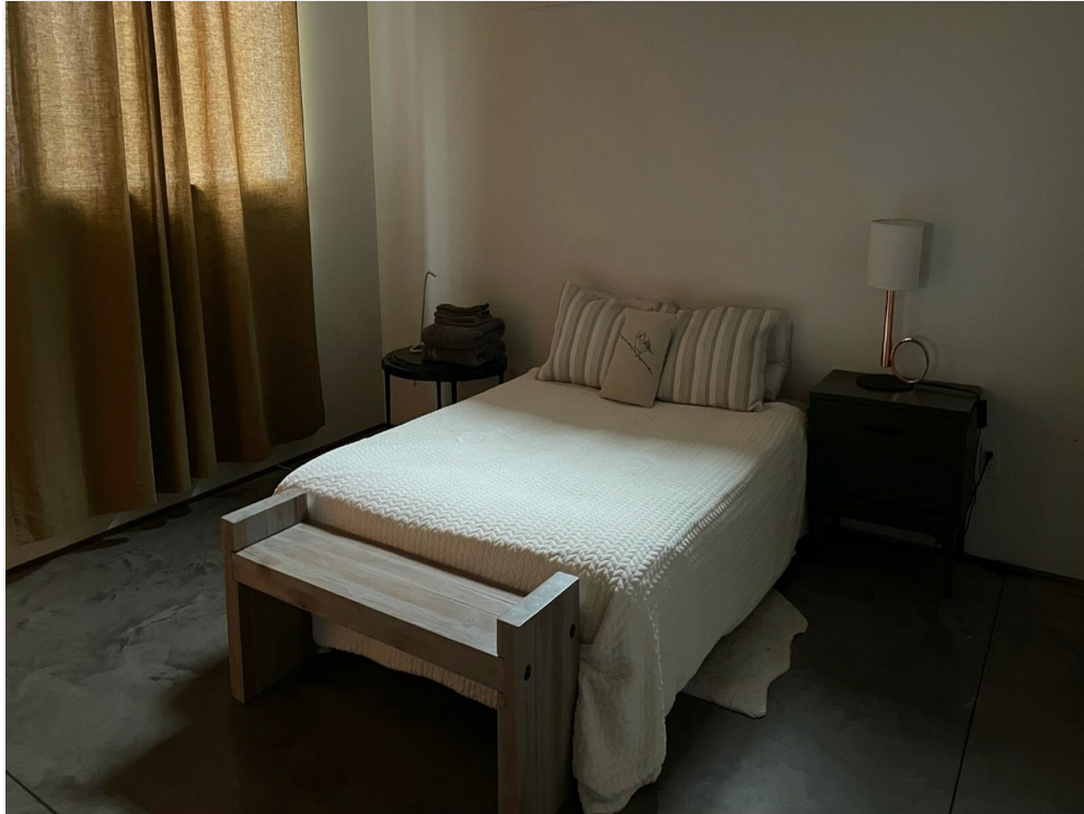
747 1/2 Columbia St - 2+ Bedroom - Unit 2