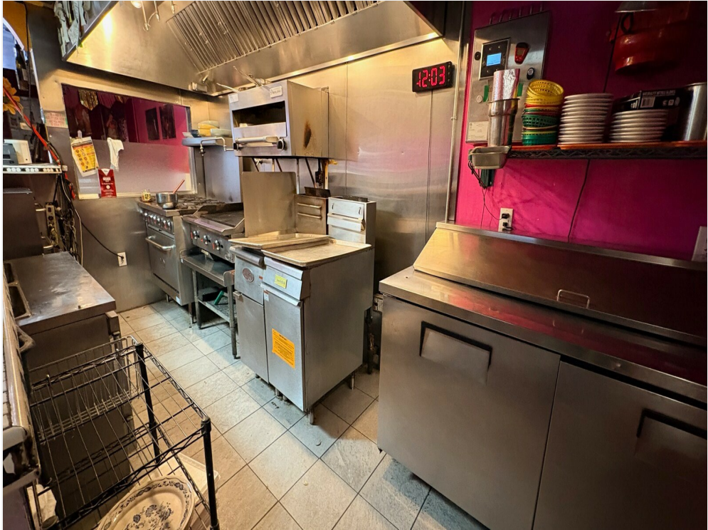
747 Columbia St - Dining Room