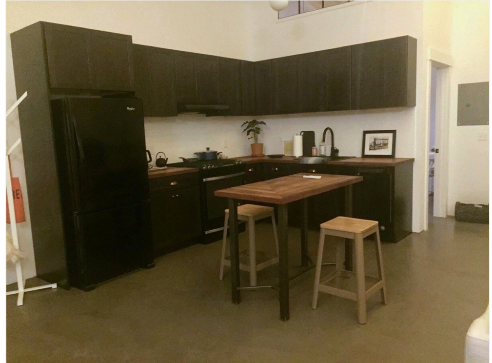
747 1/2 Columbia St - Studio - Unit 1