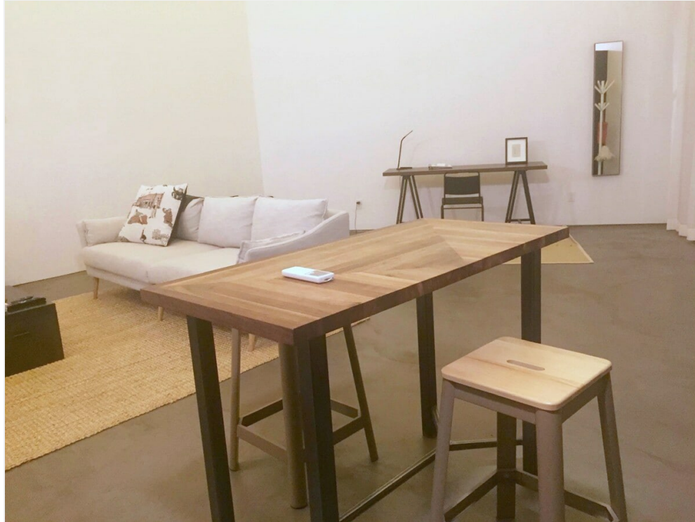
747 1/2 Columbia St - Studio - Unit 1