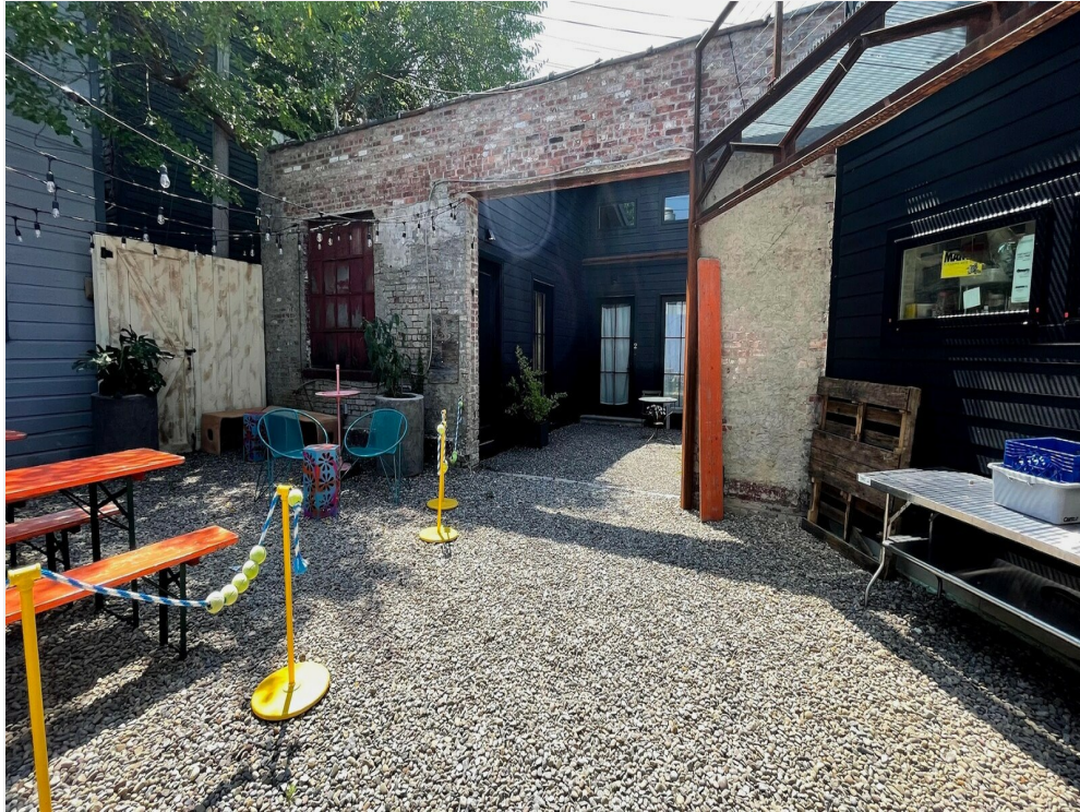
747 1/2 Columbia St Front Courtyard