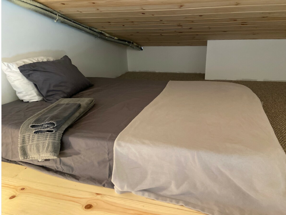
747 1/2 Columbia St - 2+ Bedroom - Unit 2