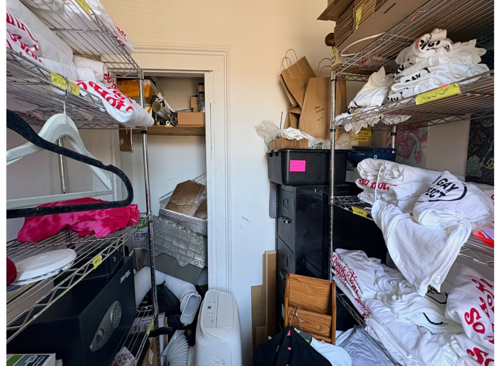
747 Columbia St - 2nd Fl - Storage