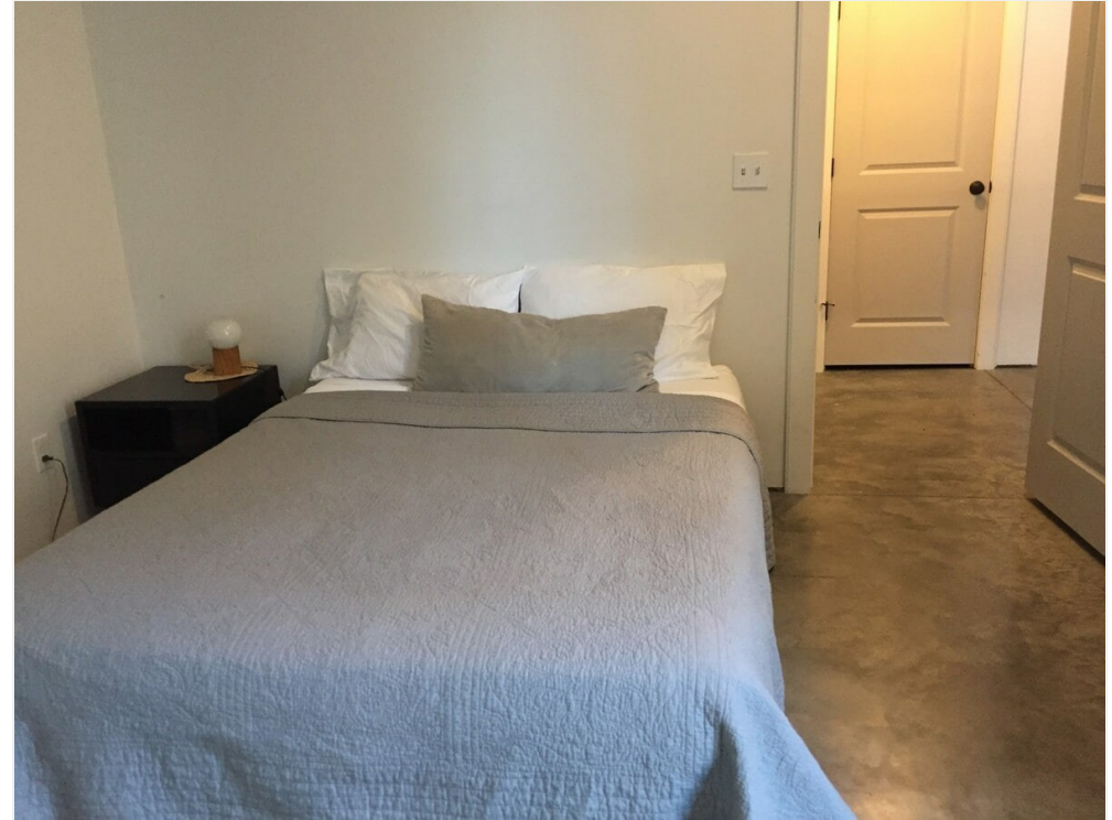
747 1/2 Columbia St - 2+ Bedroom - Unit 2