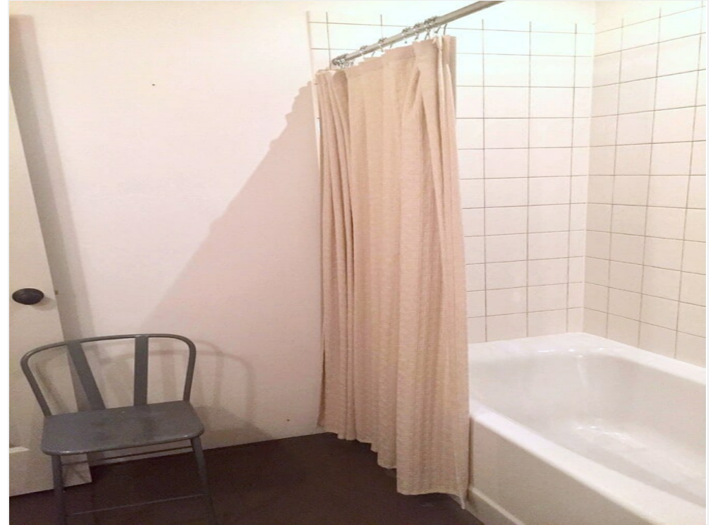
747 1/2 Columbia St - Studio - Unit 1