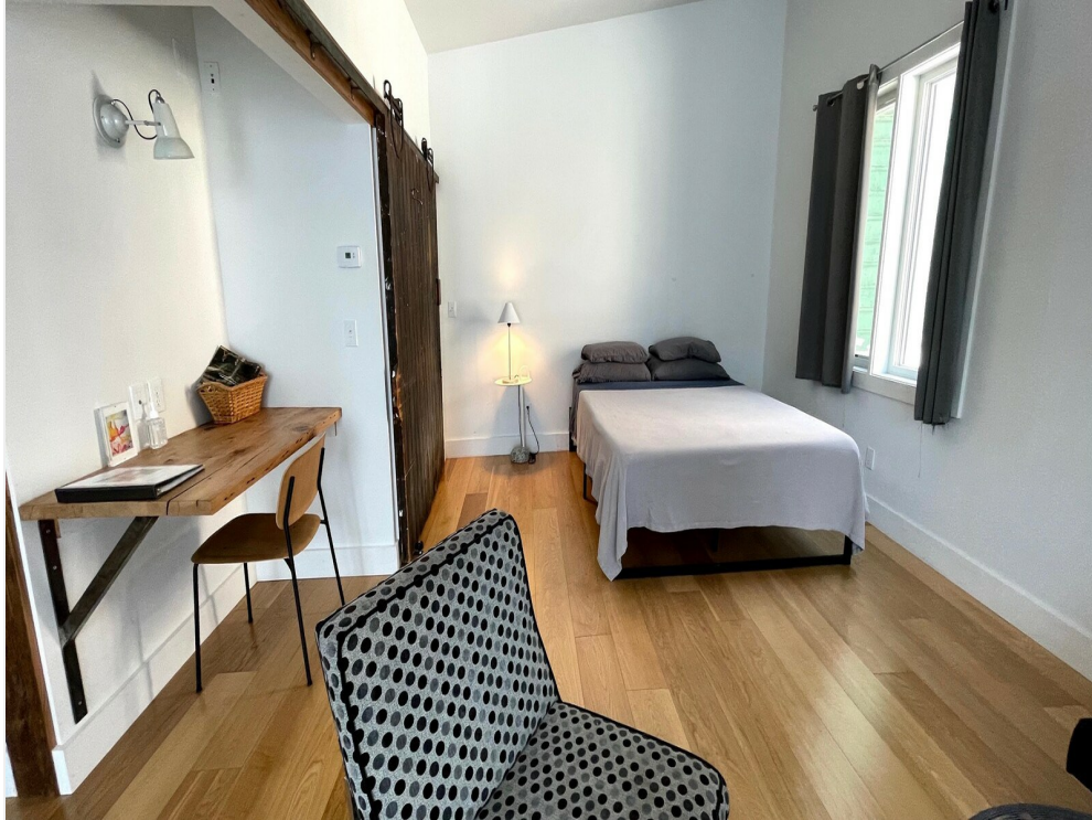
747 Columbia St