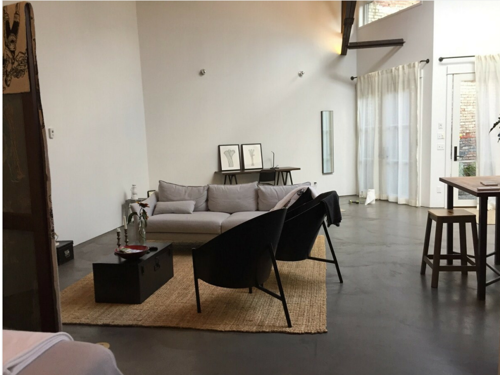
747 1/2 Columbia St - Studio - Unit 1