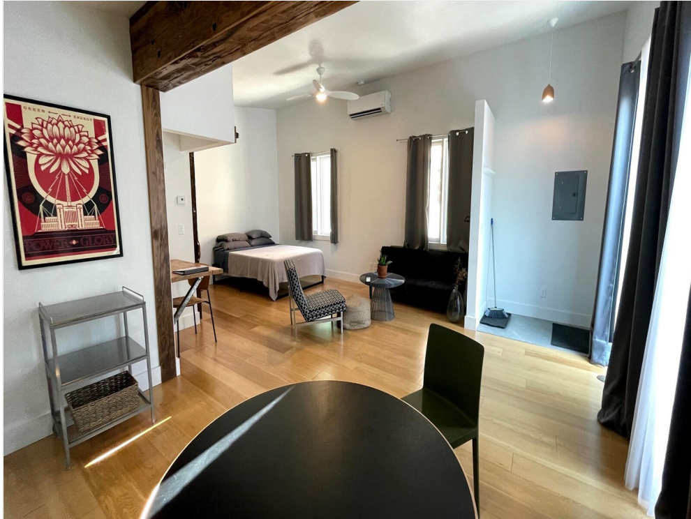
747 Columbia St