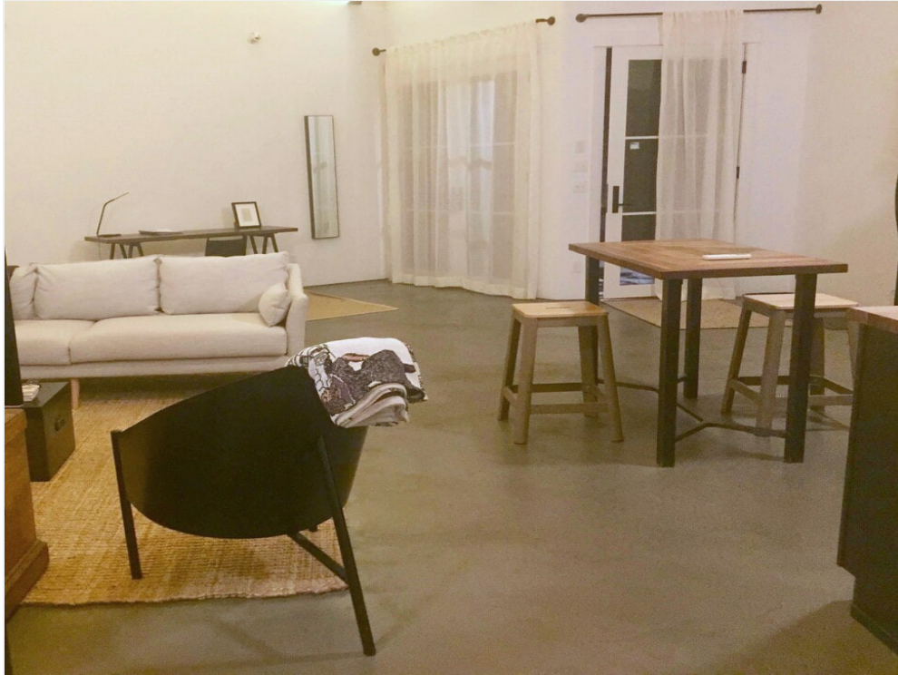
747 1/2 Columbia St - Studio - Unit 1