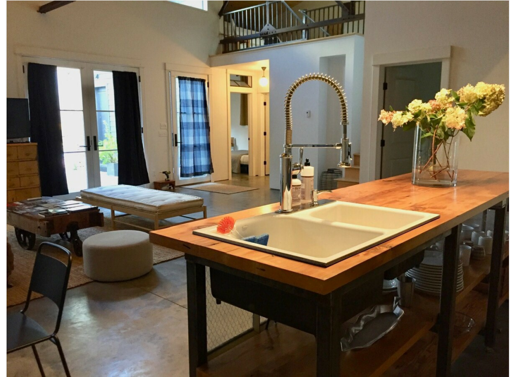
747 1/2 Columbia St - 2+ Bedroom - Unit 2