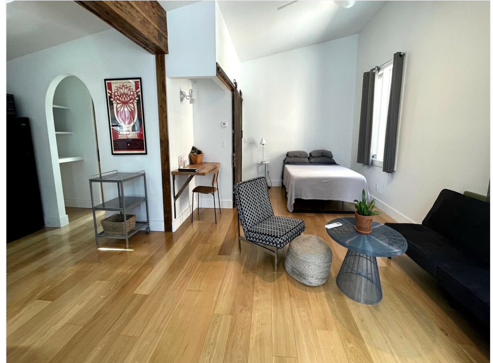
747 Columbia St - Studio Apartment