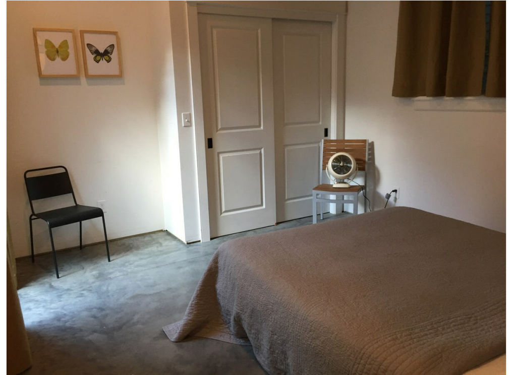
747 1/2 Columbia St - 2+ Bedroom - Unit 2