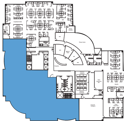
THIRD FLOOR - 10,346 RSF