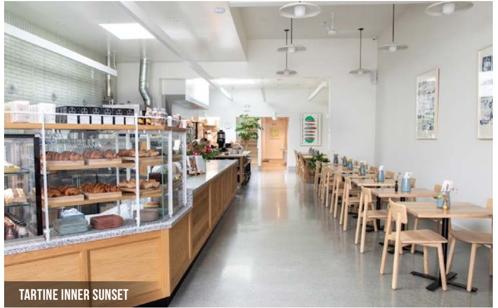
TARTINE INNER SUNSET