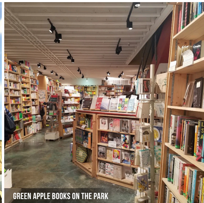
GREEN APPLE BOOKS ON THE PARK