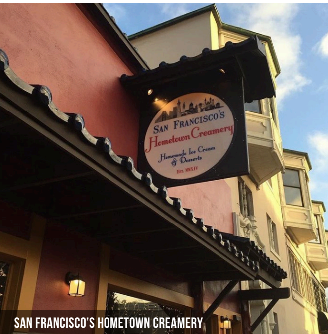
SAN FRANCISCO'S HOMETOWN CREAMERY