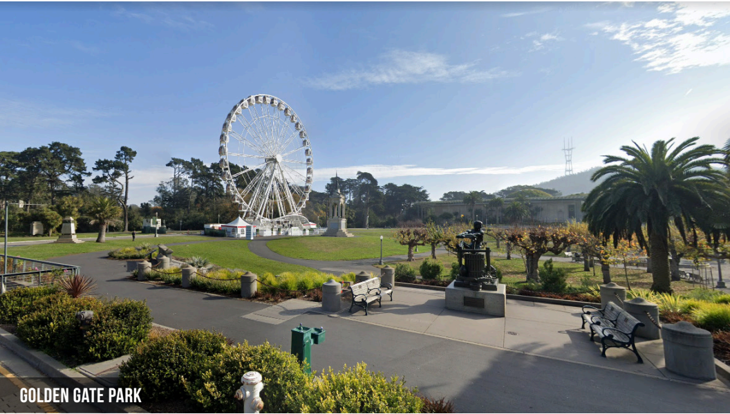
GOLDEN GATE PARK