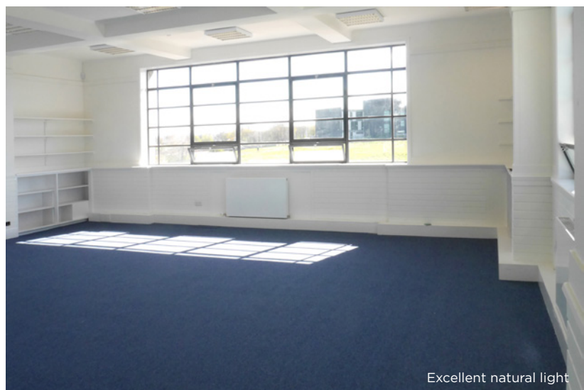
Excellent natural light