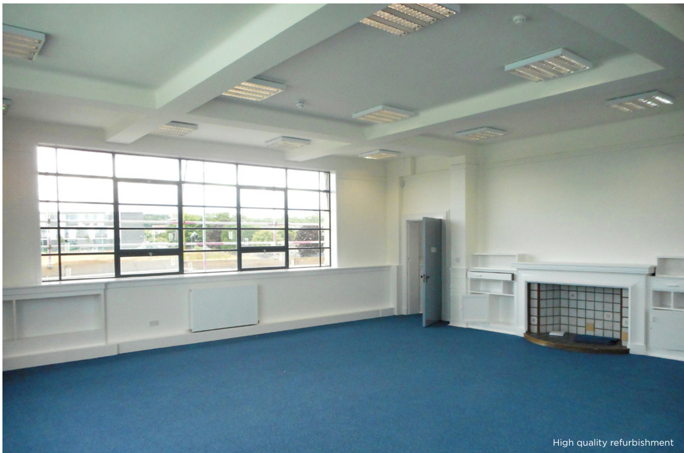
High quality refurbishment