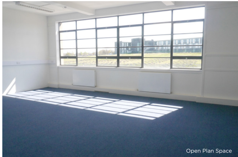
Open Plan Space

A floor plan is provided on the next page showing the layout and range of floor areas available.