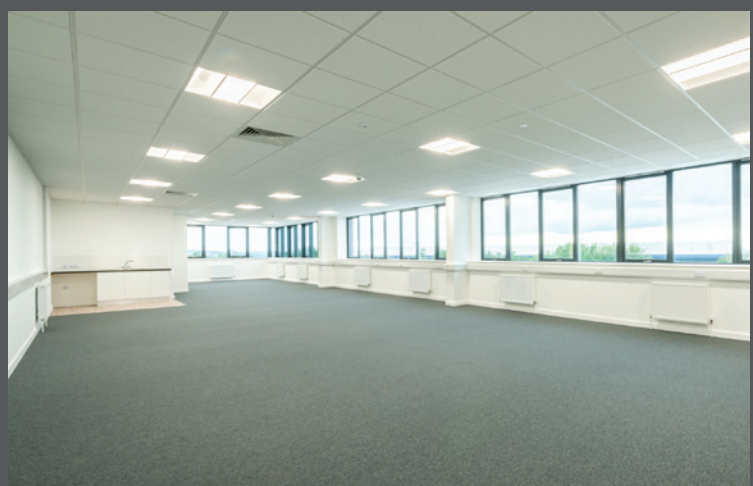
Indicative internal of our recently completed scheme at Ashroyd Business Park