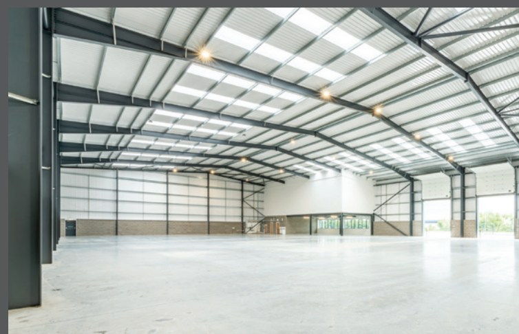
Indicative internal of our recently completed scheme at Ashroyd Business Park