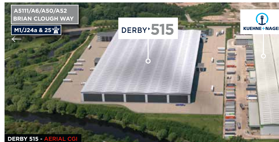
DERBY 515 - AERIAL CGI

Derby 515 is located two miles east of the city, on the A511/A6 which in turn provides direct access to junction 25 of the M1 via the A52, and to junction 24a of the M1 via the A6/A50.