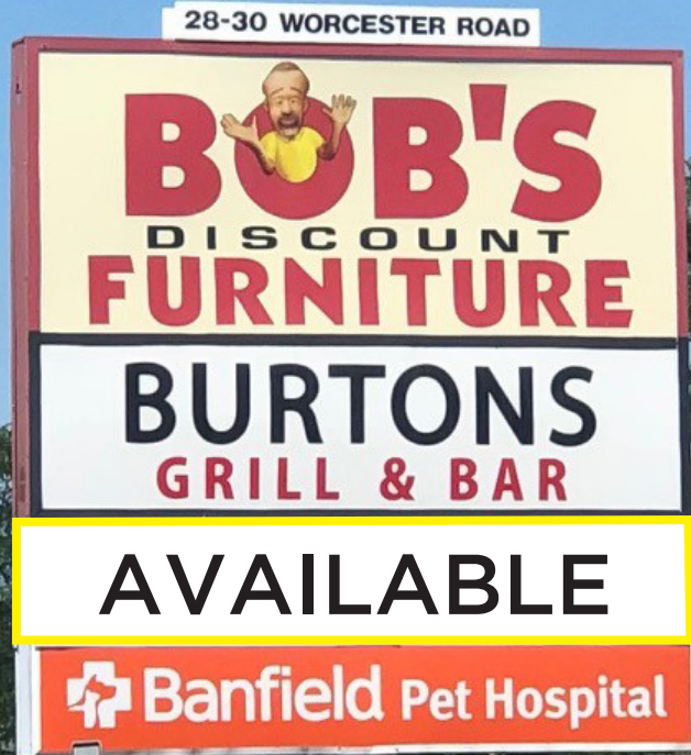
VIEW FROM ROUTE 9 WEST BOUND