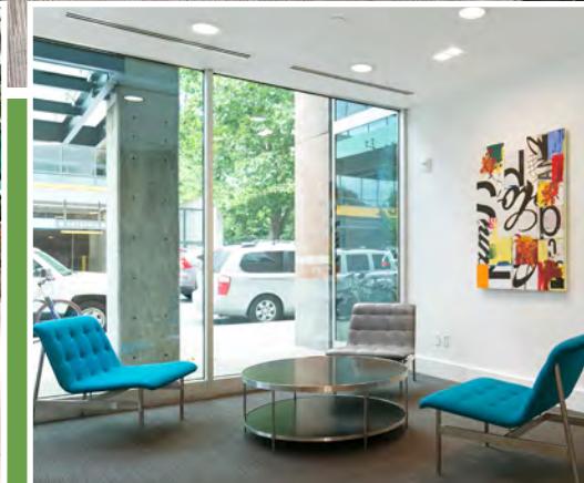
NEW 1100 DEXTER LOBBY