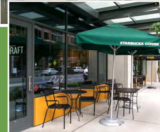
STARBUCKS ACROSS THE STREET