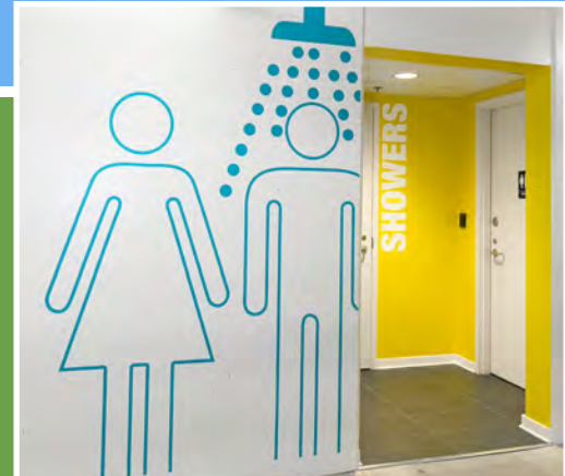
BUILDING SHOWERS & LOCKERS