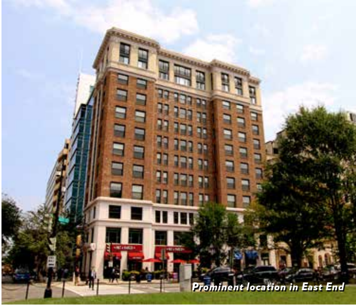
Prominent location in East End