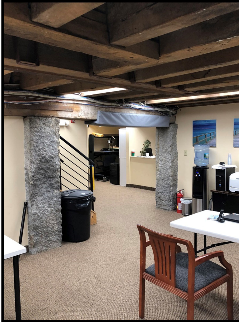
Brick & Beam