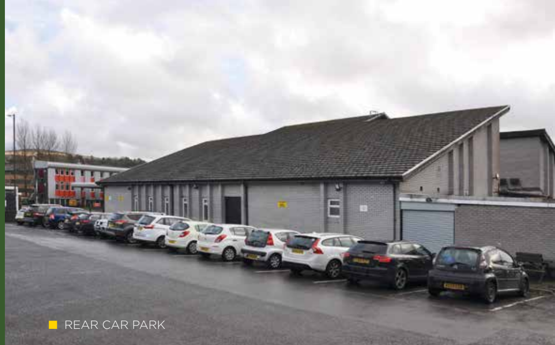
■ REAR CAR PARK

The site area is approximately 0.718 acres.