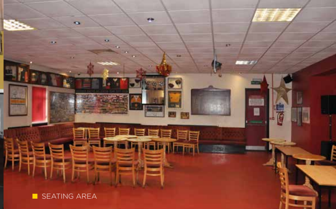
■ SEATING AREA