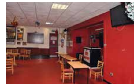
■ SEATING AREA

The property is currently occupied under 'Social Club' use. Any interested parties would need to apply for a change of use via the planning department of the Local Authority.