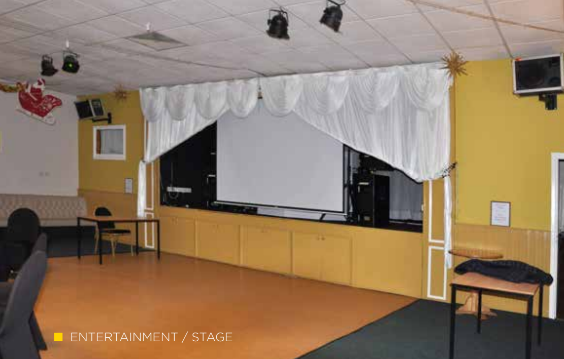
■ ENTERTAINMENT / STAGE