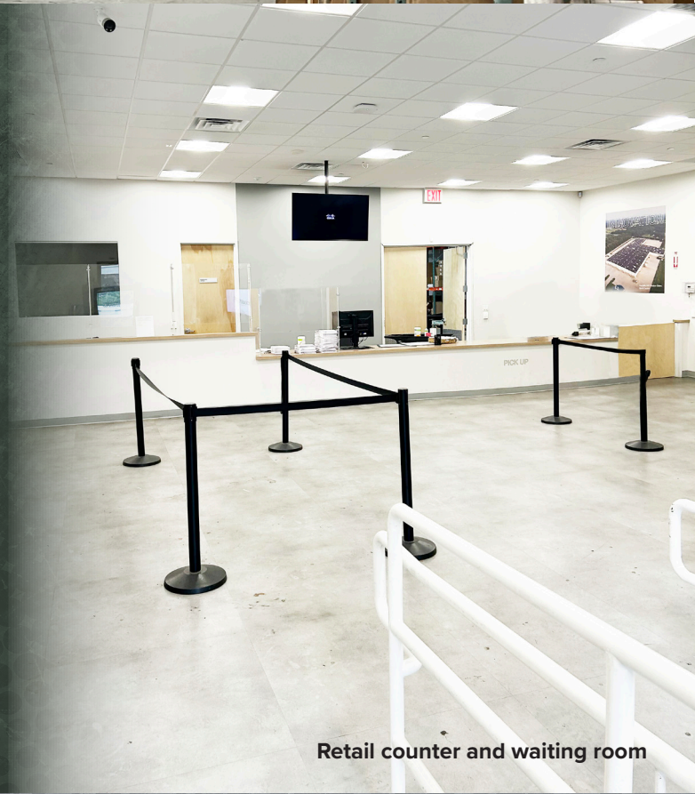
Retail counter and waiting room