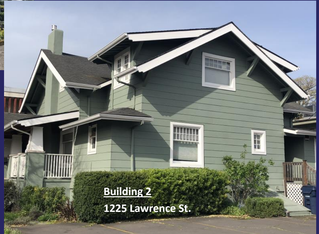
Building 2 1225 Lawrence St.