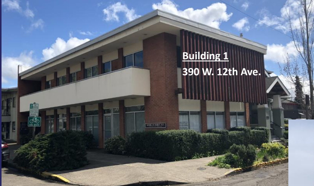
Building 1 390 W. 12th Ave.

1225 Lawrence St./390 W. 12th Ave. Eugene, OR 97401