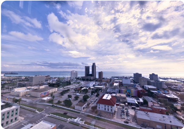
Bay Front View #2