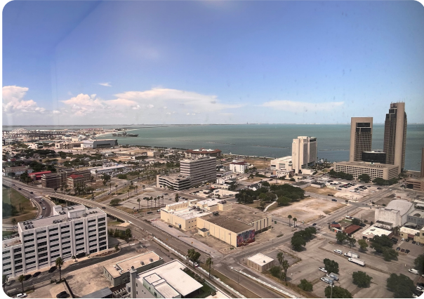
Bay Front View #1