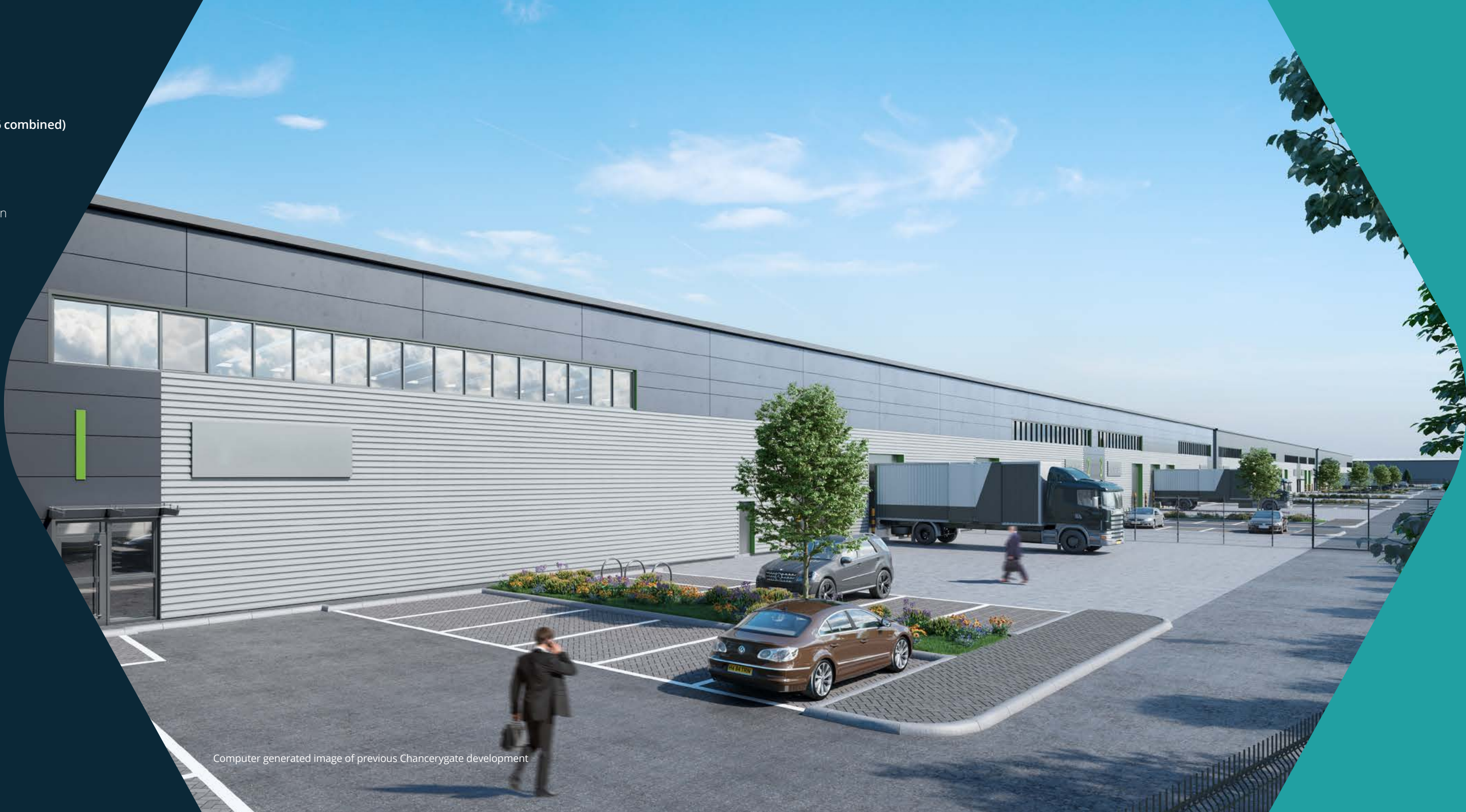
Computer generated image of previous Chancerygate development

The virtual Freehold of the units are available for sale. Leasehold options will be considered subject to covenant strength.