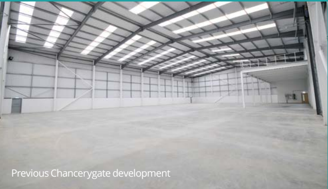
Previous Chancerygate development