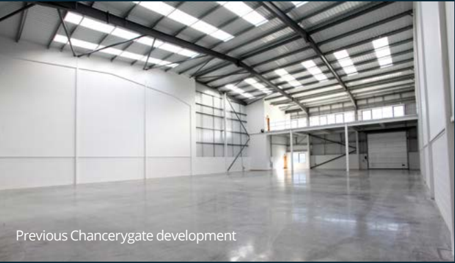
Previous Chancerygate development