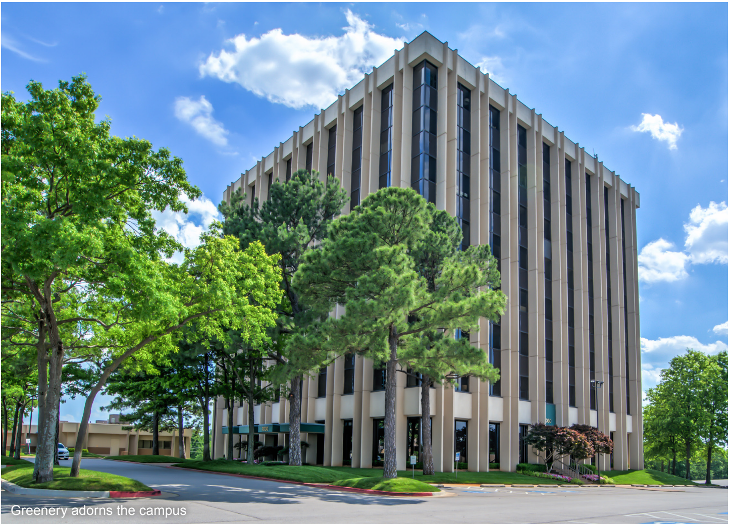
Greenery adorns the campus