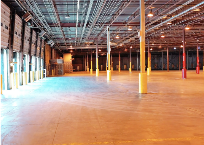
18 (8' X 10') LOADING DOCK DOORS