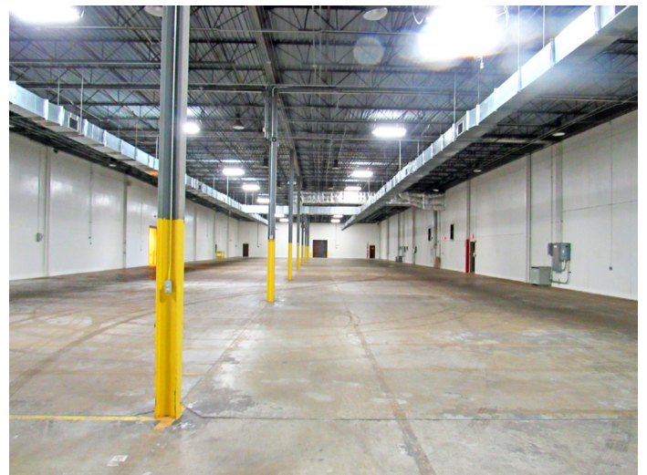
20,000SF FULLY CONDITIONED SPACE