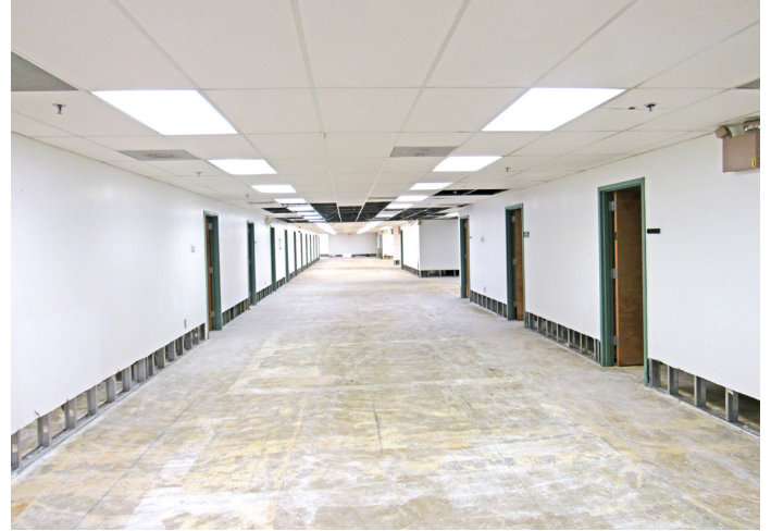
OFFICE - 18 PERIMETER OFFICES