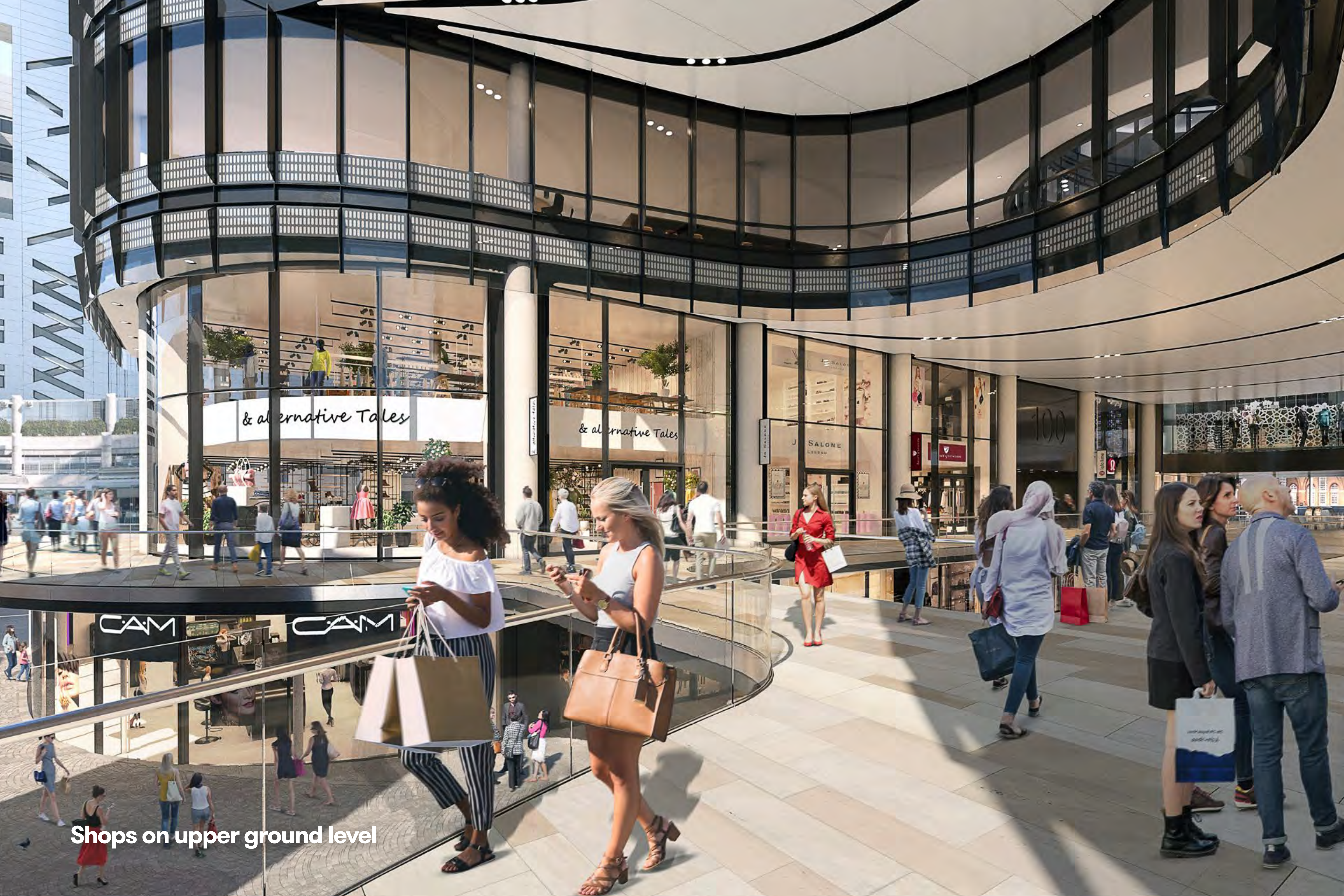
Shops on upper ground level