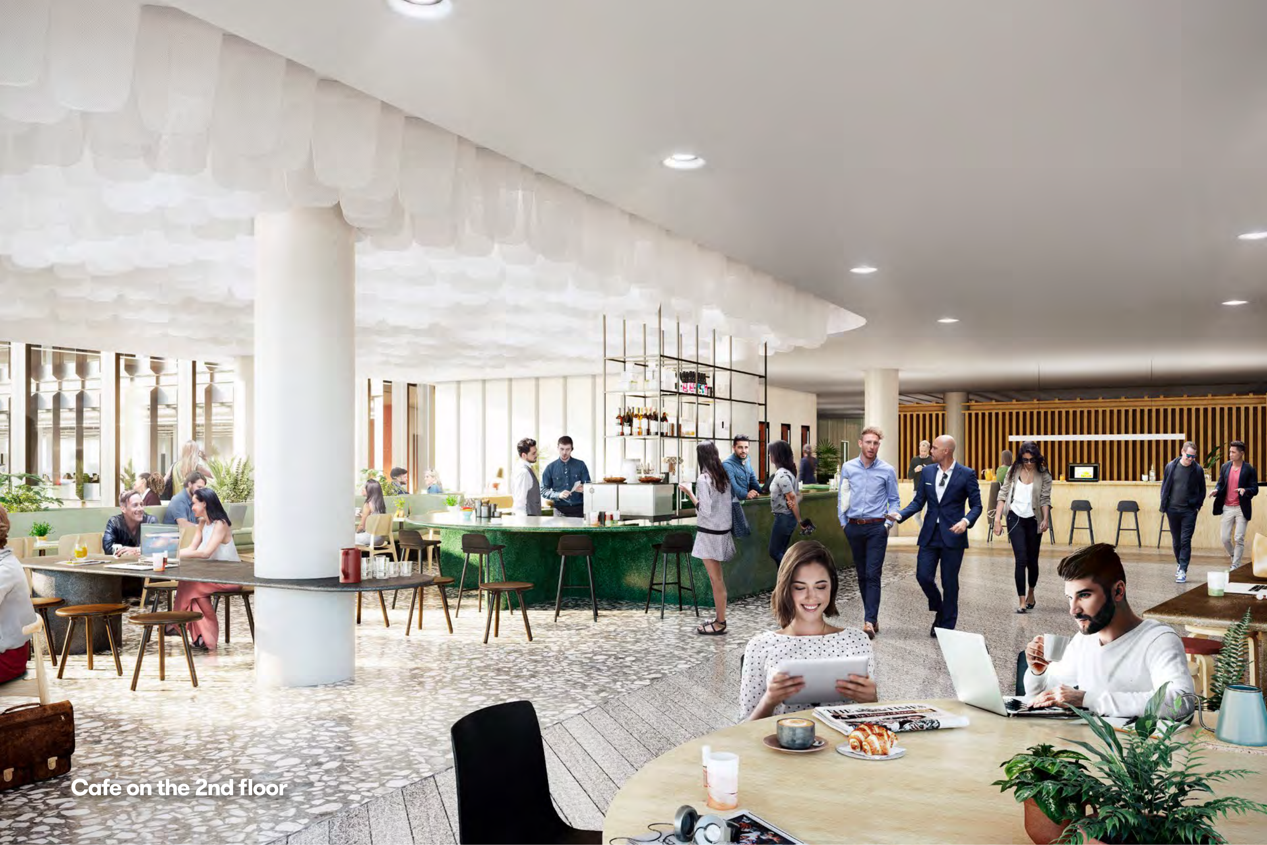
Cafe on the 2nd floor