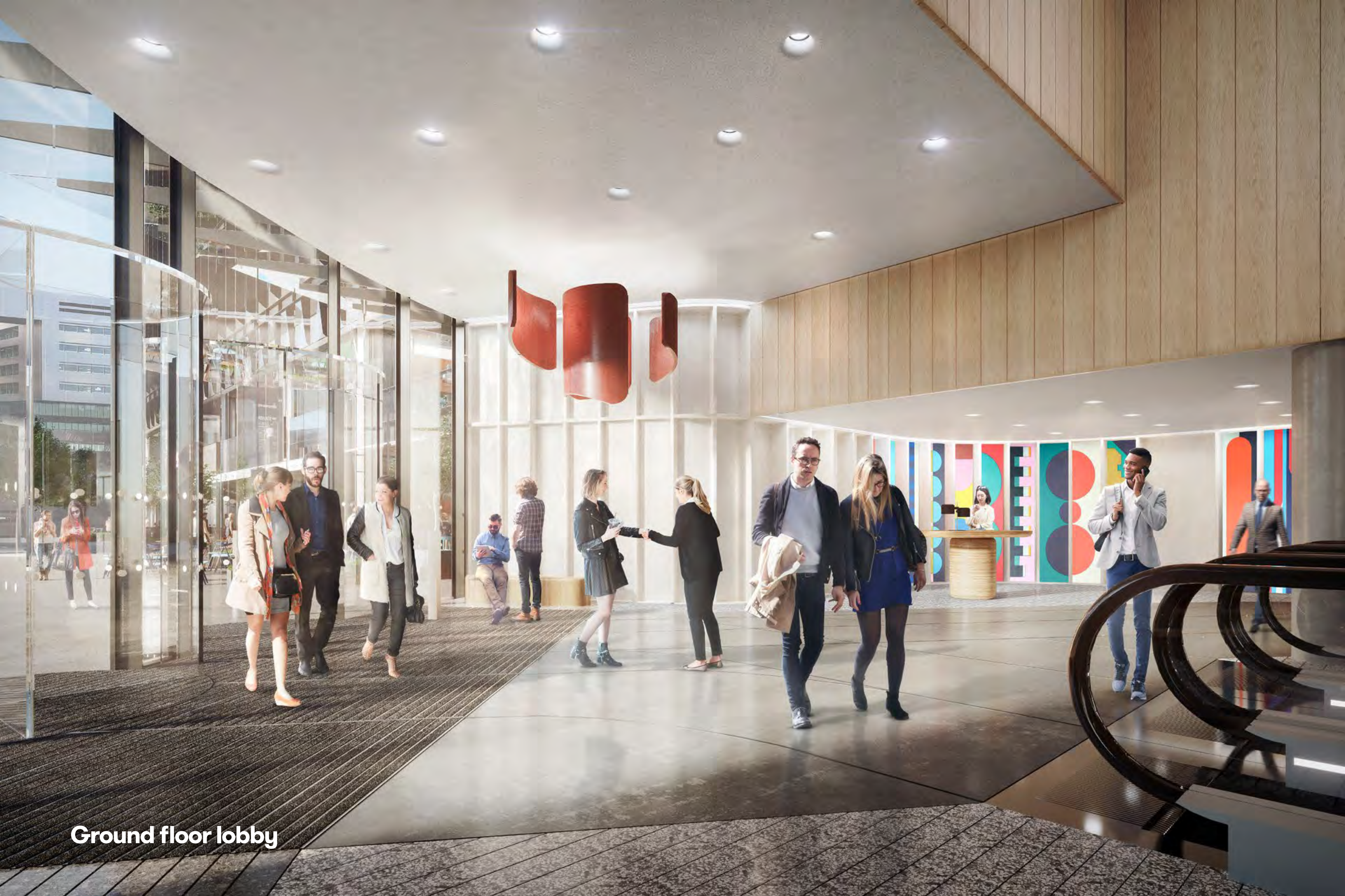
Ground floor lobby