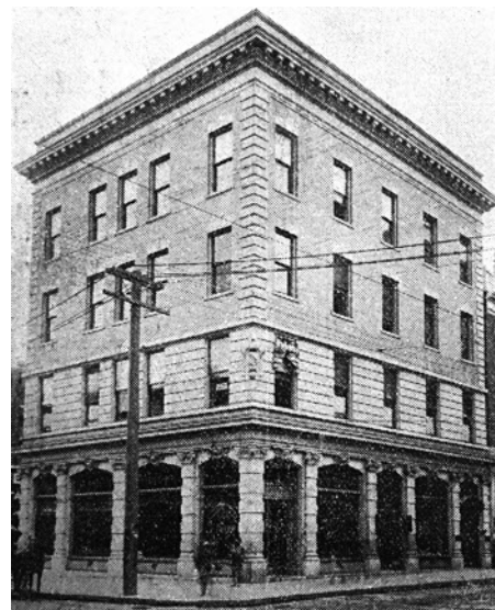
Photo of the Albemarle in 1904

Although the information contained herein was provided by sources believed to be reliable, The Morgan Real Estate Group makes no representation, expressed or implied, as to its accuracy and said information is subject to errors, omissions or changes.