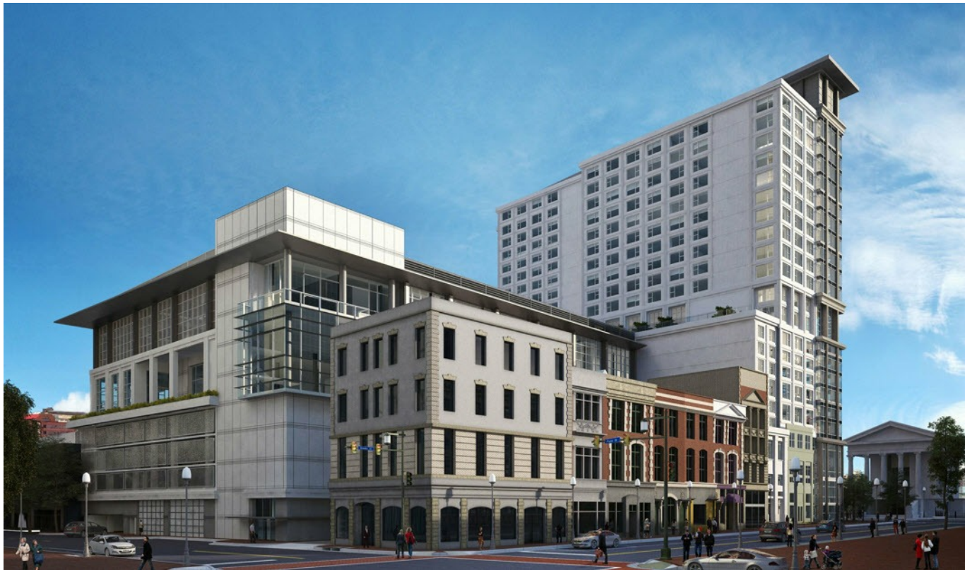
Rendering with the completed Hilton Hotel & Convention Center