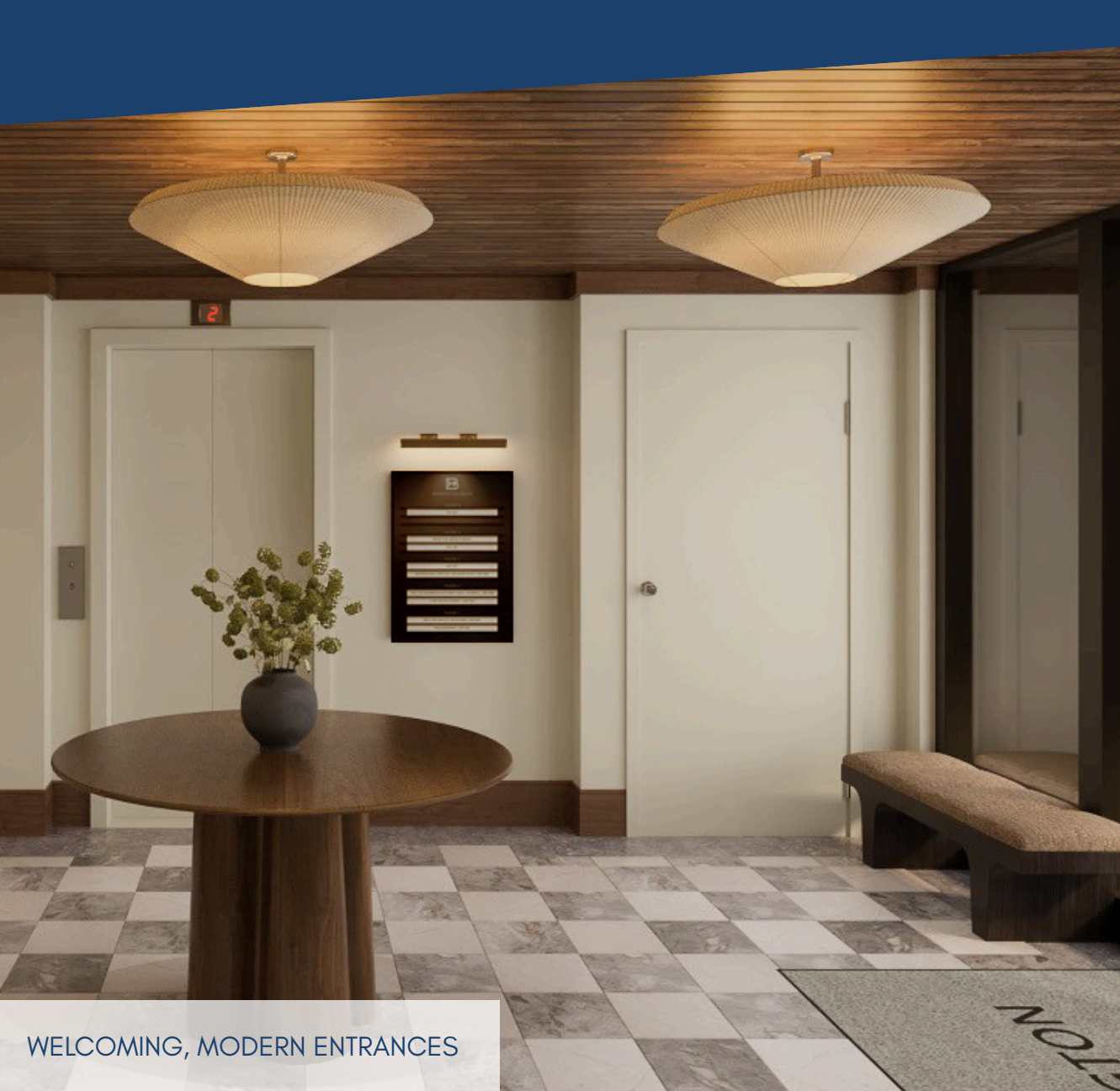
WELCOMING, MODERN ENTRANCES

A Professional, Modern Setting for Client-Facing Businesses