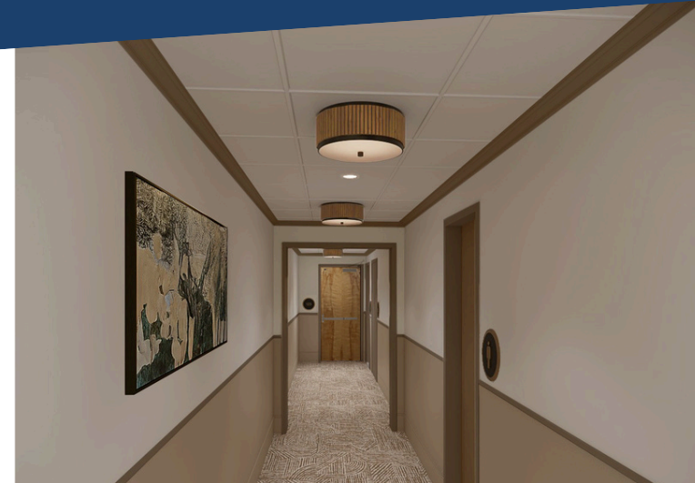
UPGRADED, THOUGHTFULLY DESIGNED CORRIDORS AND INTERIORS