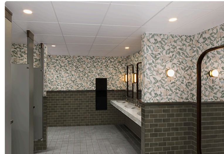
FULLY RENOVATED, UPDATED RESTROOMS