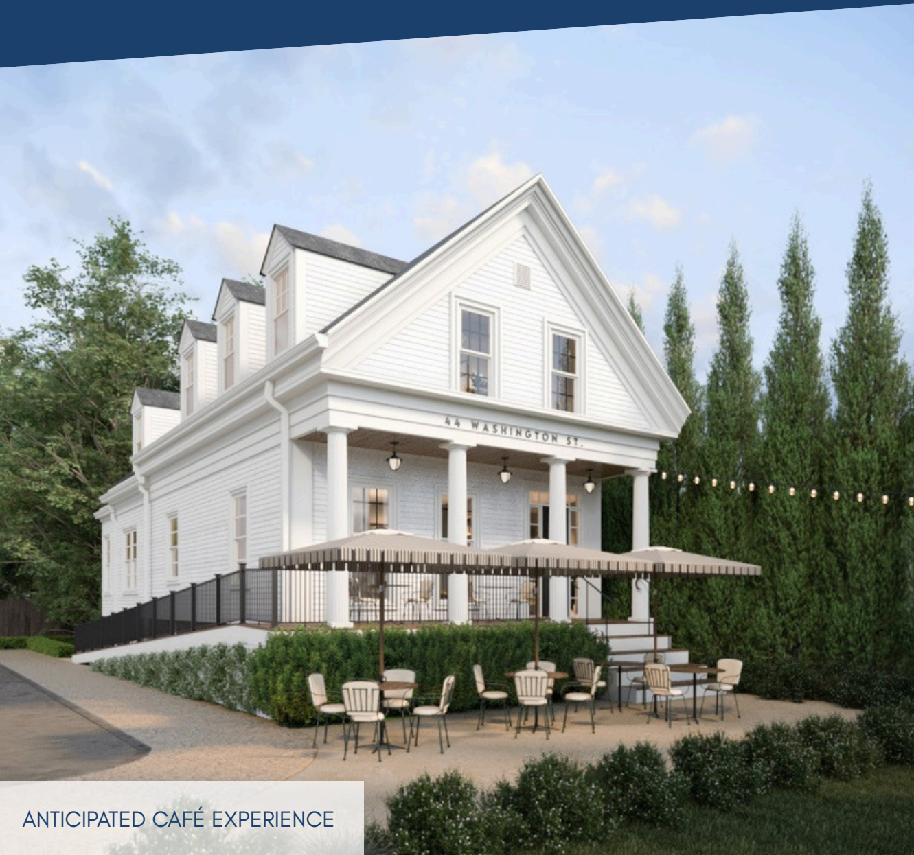
ANTICIPATED CAFÉ EXPERIENCE