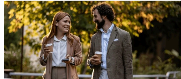
CAMPUS & RETAIL WALKABILITY