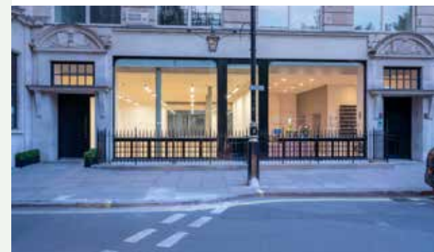
Exterior at night