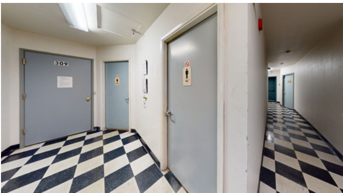
COMMON AREA RESTROOMS