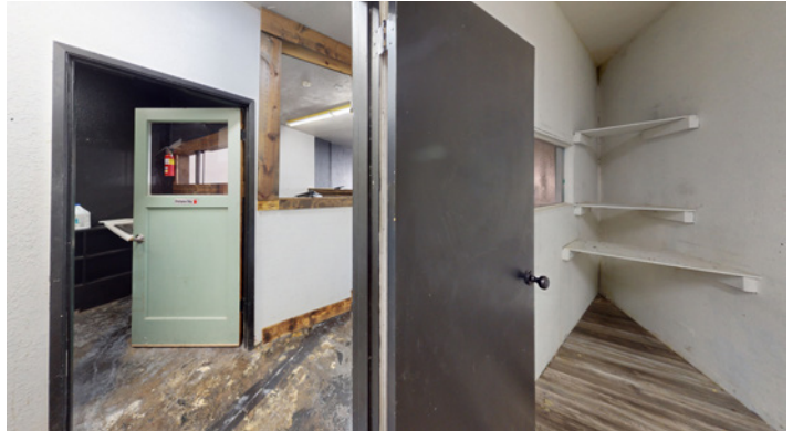
SUITE 307: OFFICE/STORAGE