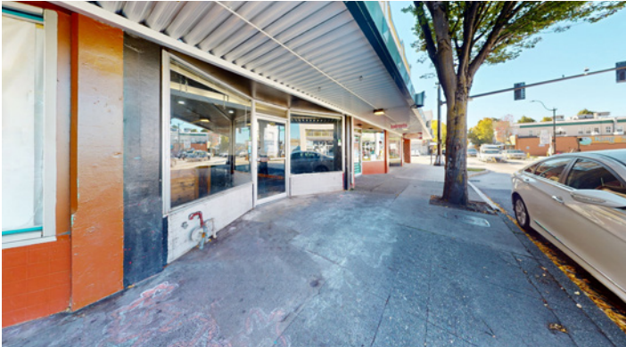
SUITE 307: 4TH AVE E STORE FRONT (FACING WEST)