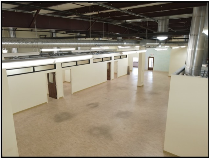
High Open Workspace