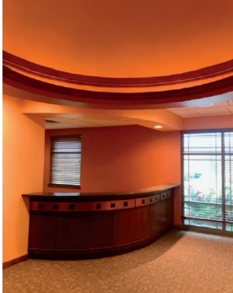
Desk in Lobby Area