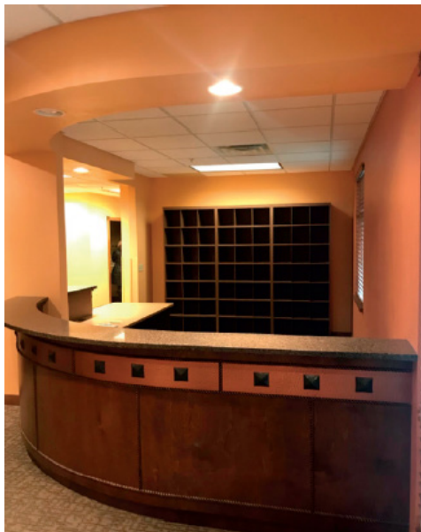
Main Reception Desk