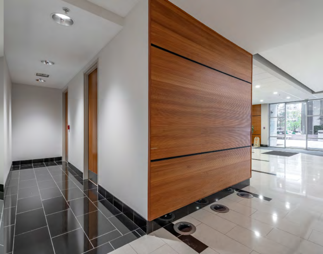
Newly Renovated Building Lobby