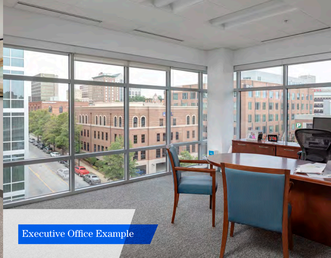
Executive Office Example