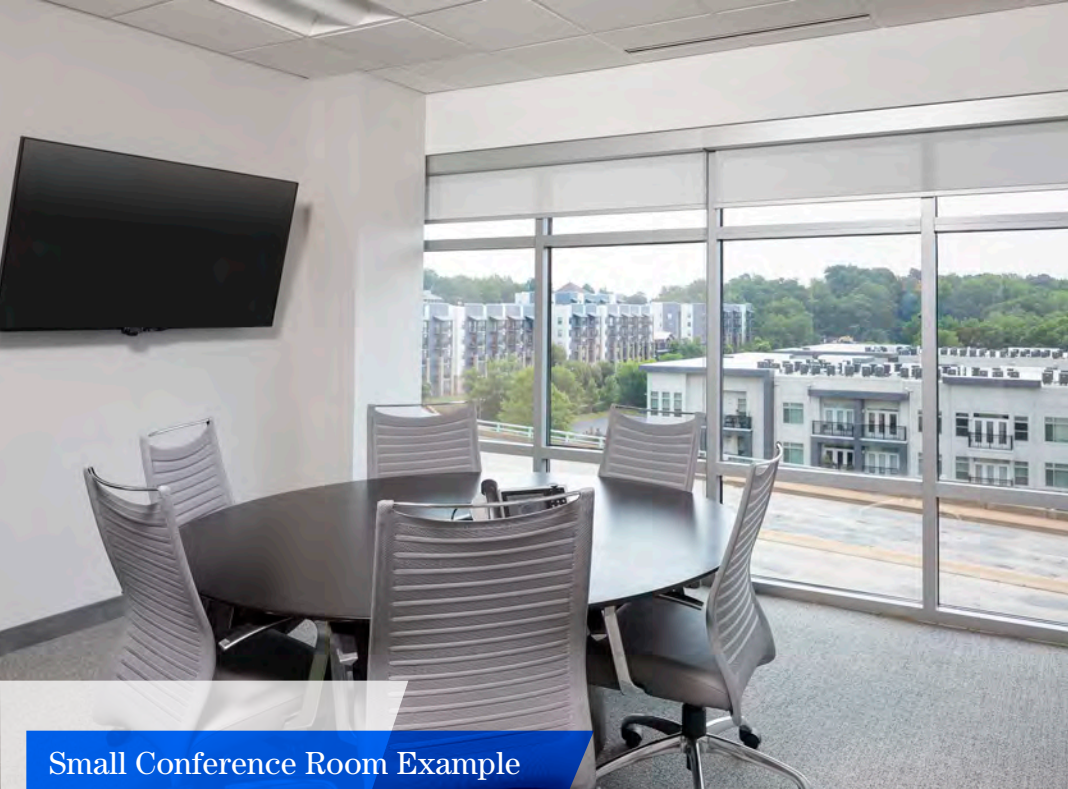
Small Conference Room Example