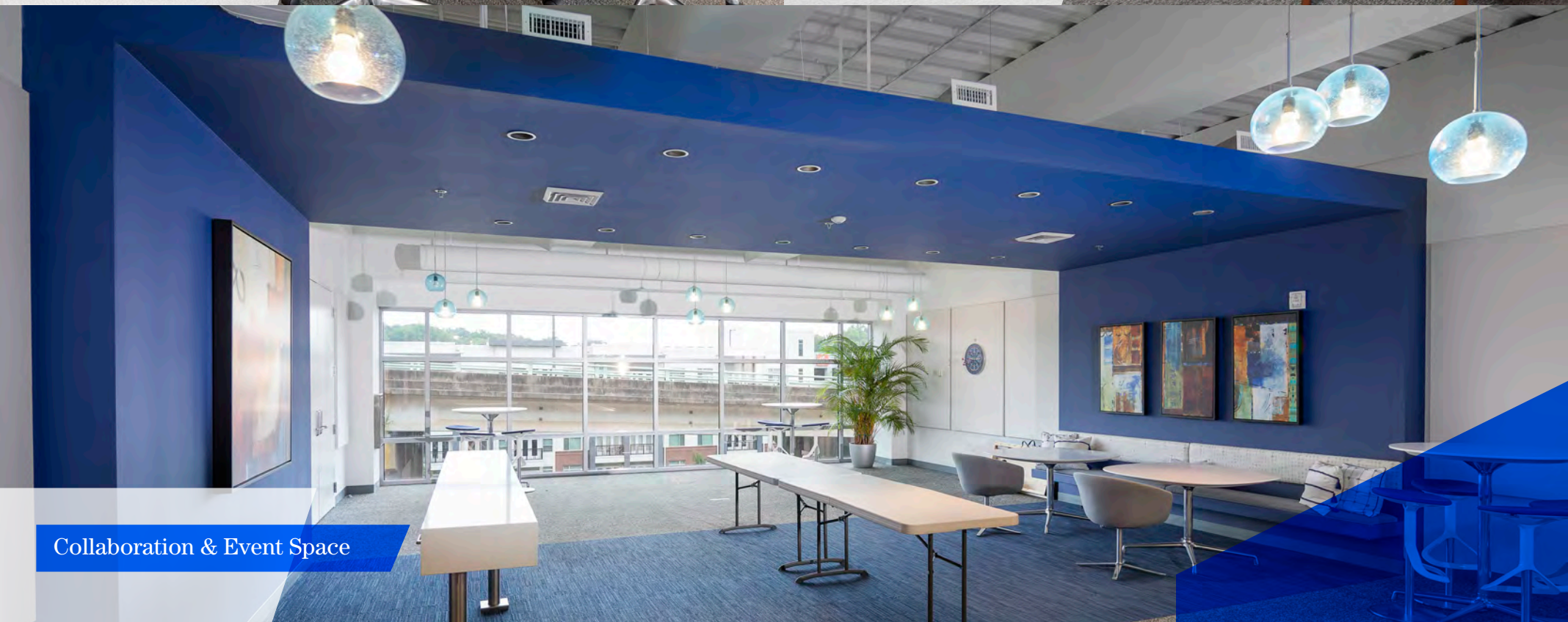
Collaboration & Event Space