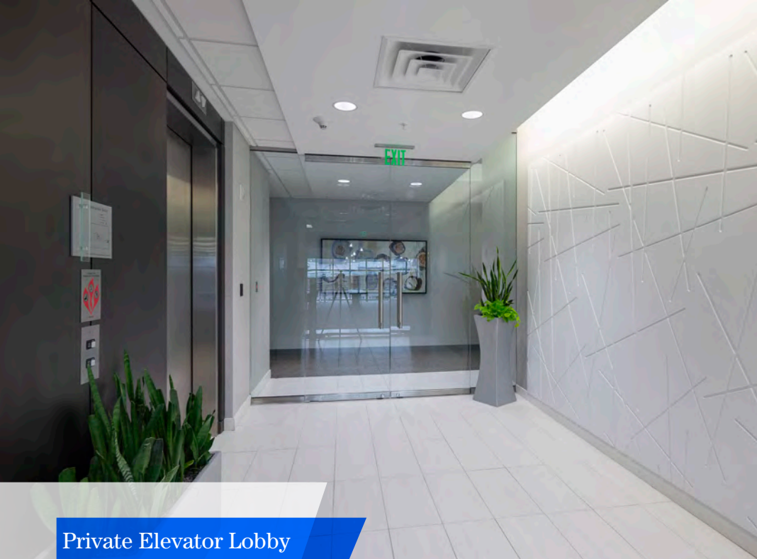
Private Elevator Lobby