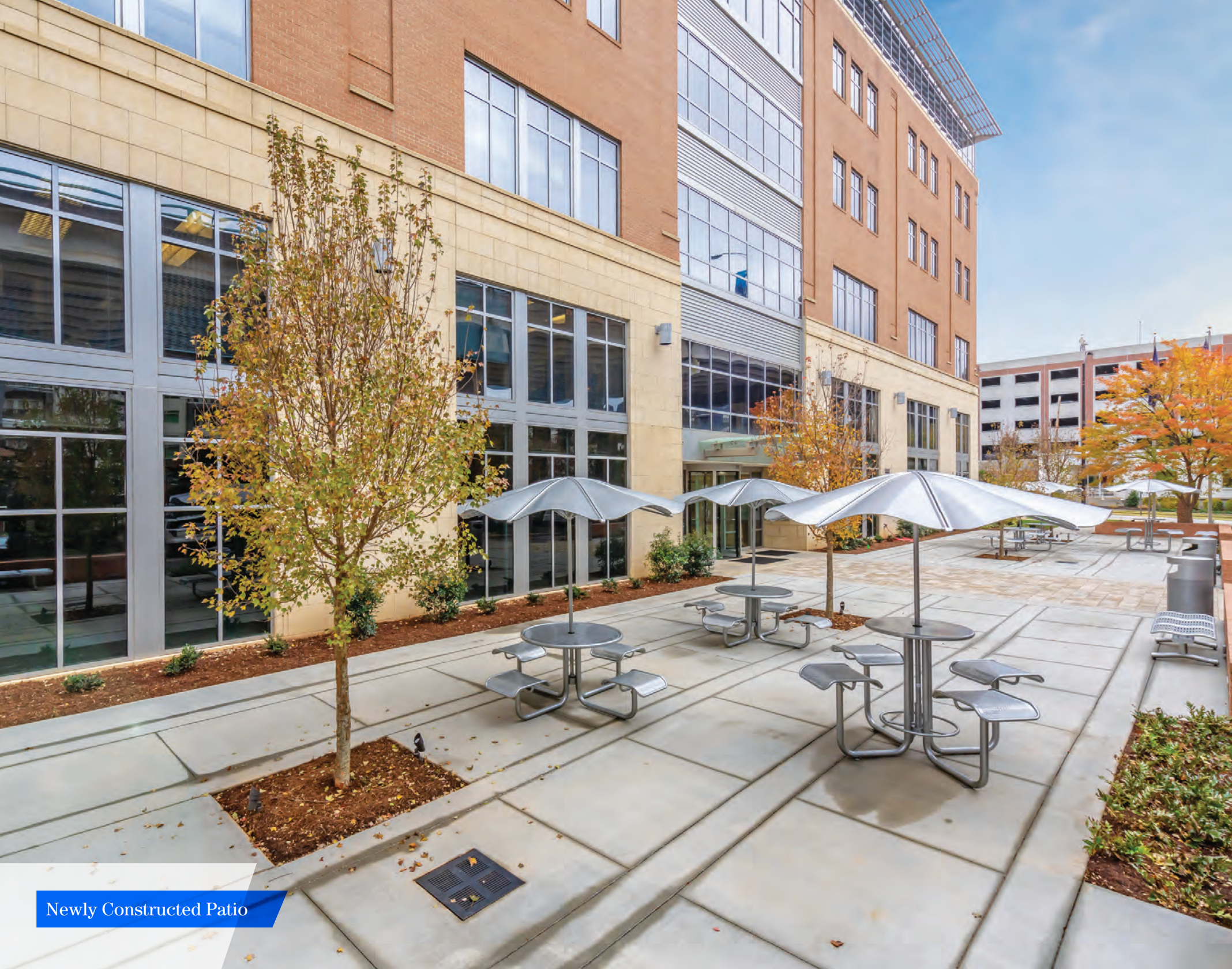
Newly Constructed Patio