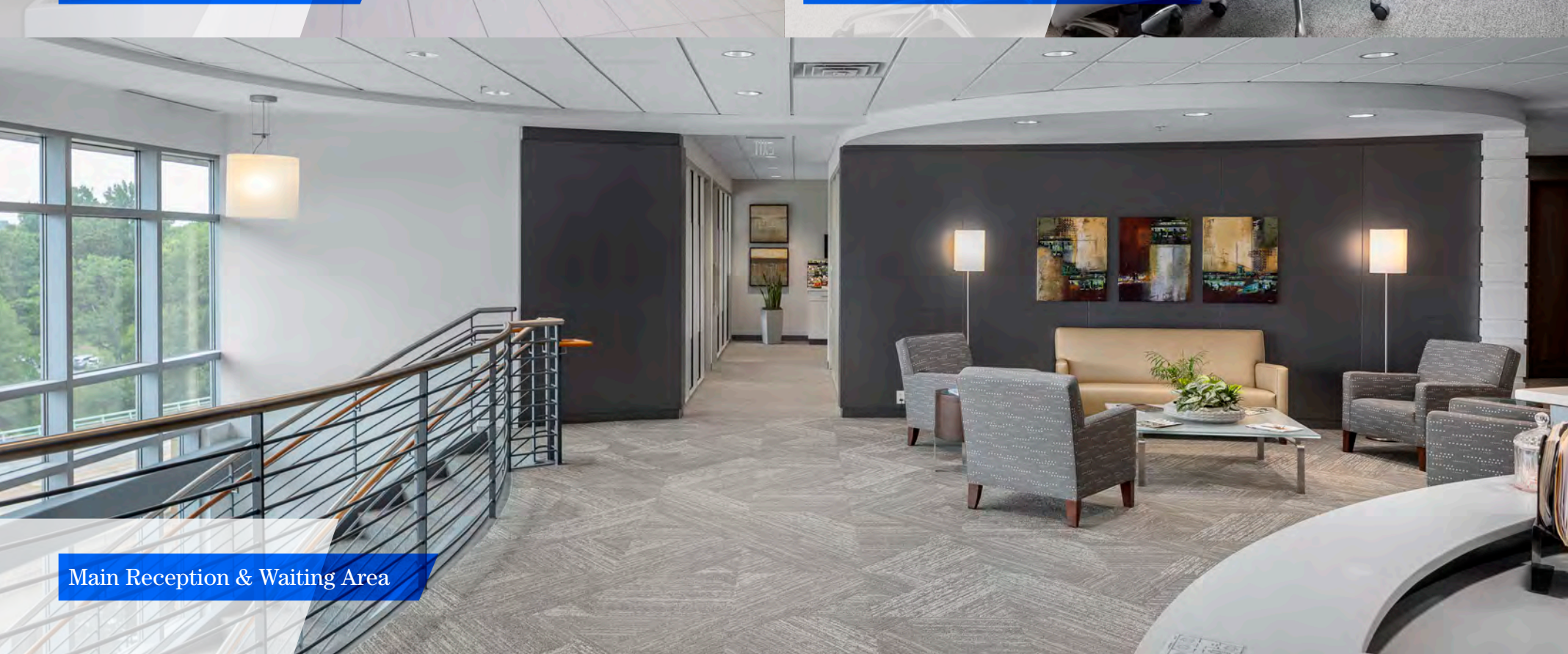
Main Reception & Waiting Area