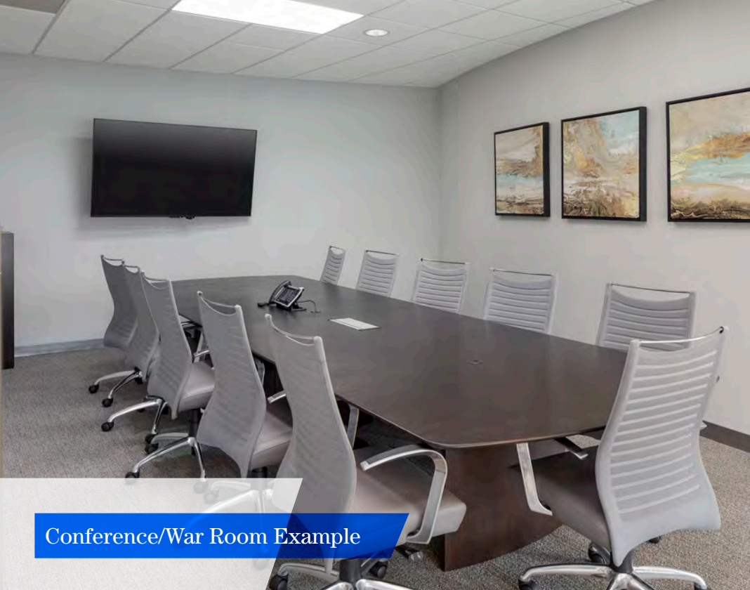
Conference/War Room Example