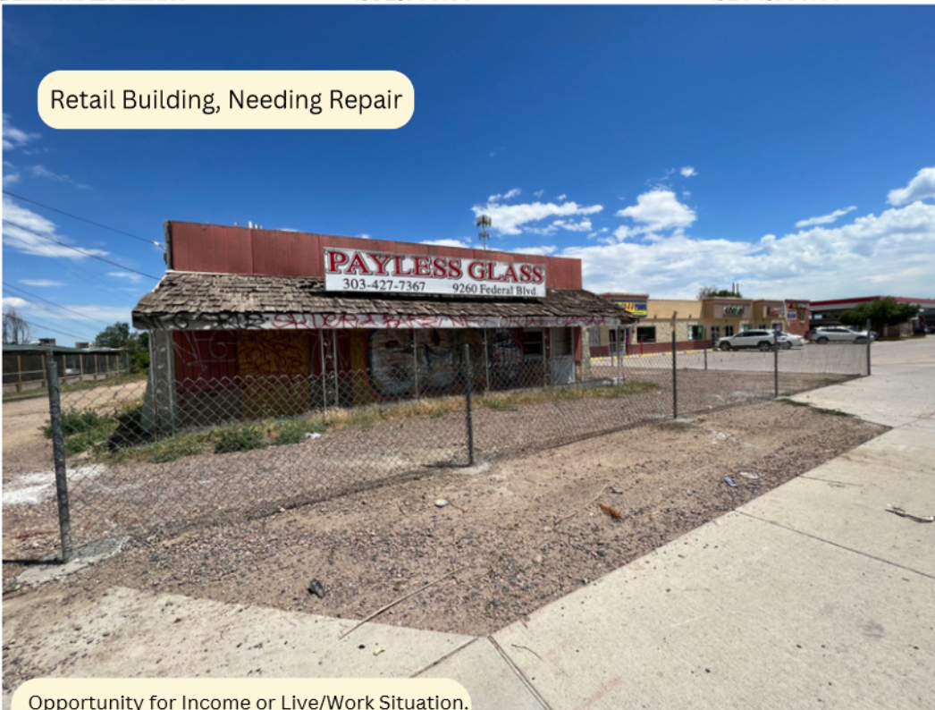
Opportunity for Income or Live/Work Situation. Residential Building is Remodeled!