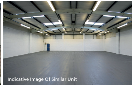
Indicative Image Of Similar Unit