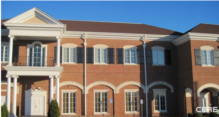
1st Floor | 3,879 SF

6636 CHURCH STREET Douglasville, GA 30134