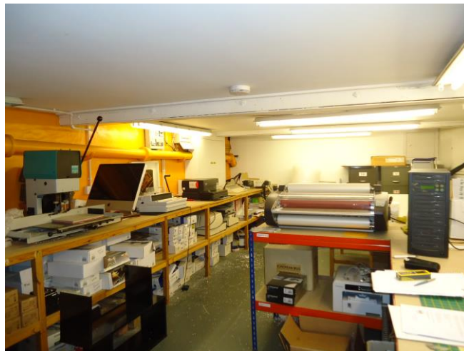
View of basement area

To be re-assessed following the alterations/subdivision works