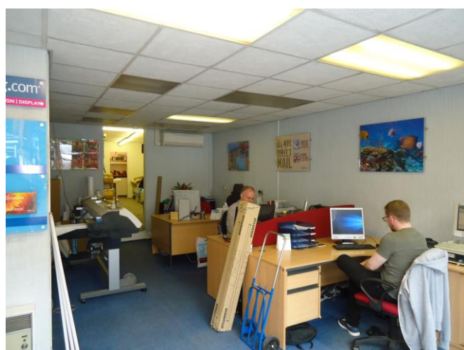
View of retail area

50 metres Copyright and confidentiality Experian, 2017. © Crown copyright and database rights 2017. OS 100019588 For more information on our products and services: www.experian.co.uk/goad | goad_sales@uk.experian.com | 0945 601 6011 Experian (Goad Plan Created: 24/08/2017) Created By: London Clancy