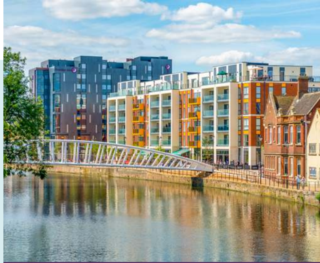
New bridge provides pedestrian link for Council offices and students between college and Harpur/Town Centre

Bedford is a strong and growing local economy