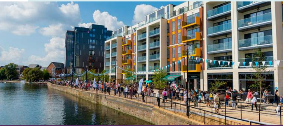
Al fresco dining is enjoyed at Riverside