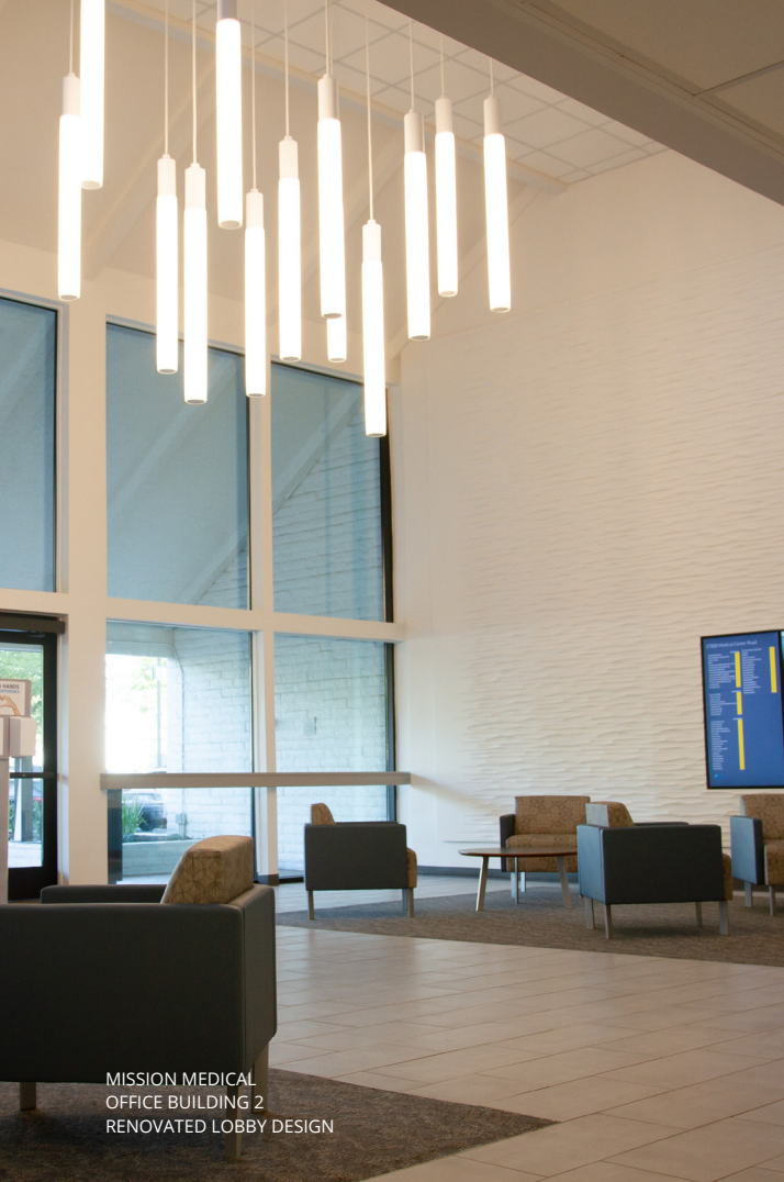
MISSION MEDICAL OFFICE BUILDING 2 RENOVATED LOBBY DESIGN