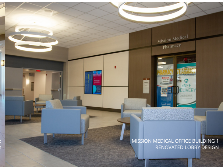
MISSION MEDICAL OFFICE BUILDING 1 RENOVATED LOBBY DESIGN