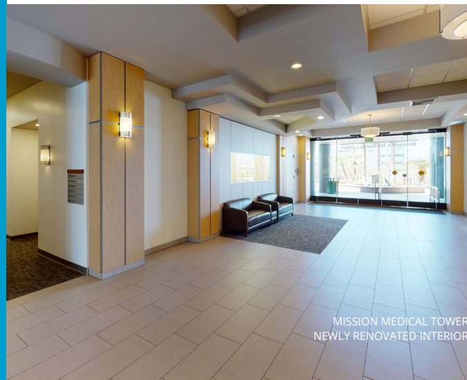
MISSION MEDICAL TOWER NEWLY RENOVATED INTERIOR

On-site Property Management and Engineering staff