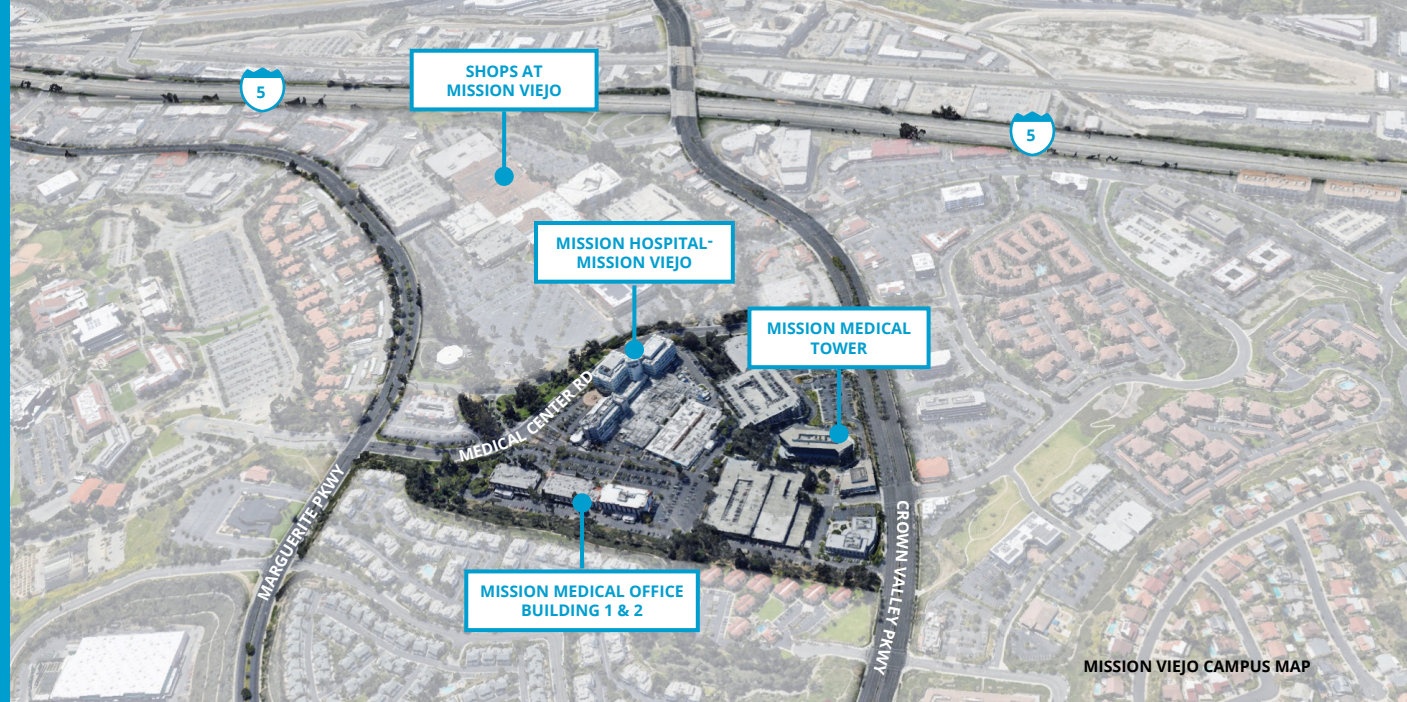
MISSION VIEJO CAMPUS MAP