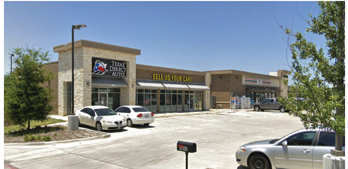
Plano | 5969 Dallas Pkwy.