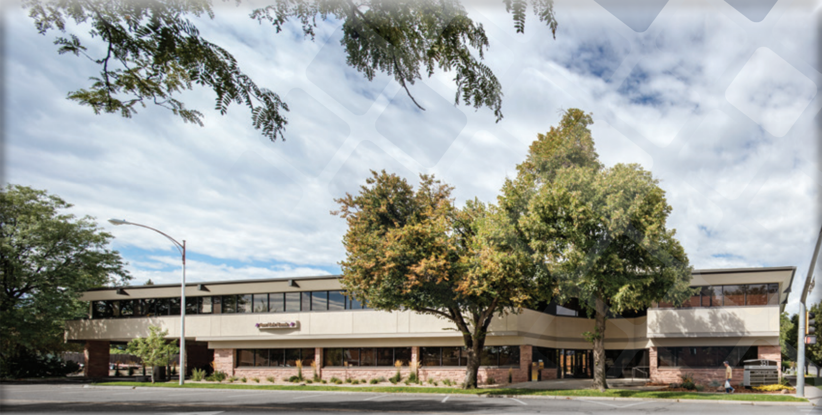
SUITE 216 - 1,850 SF