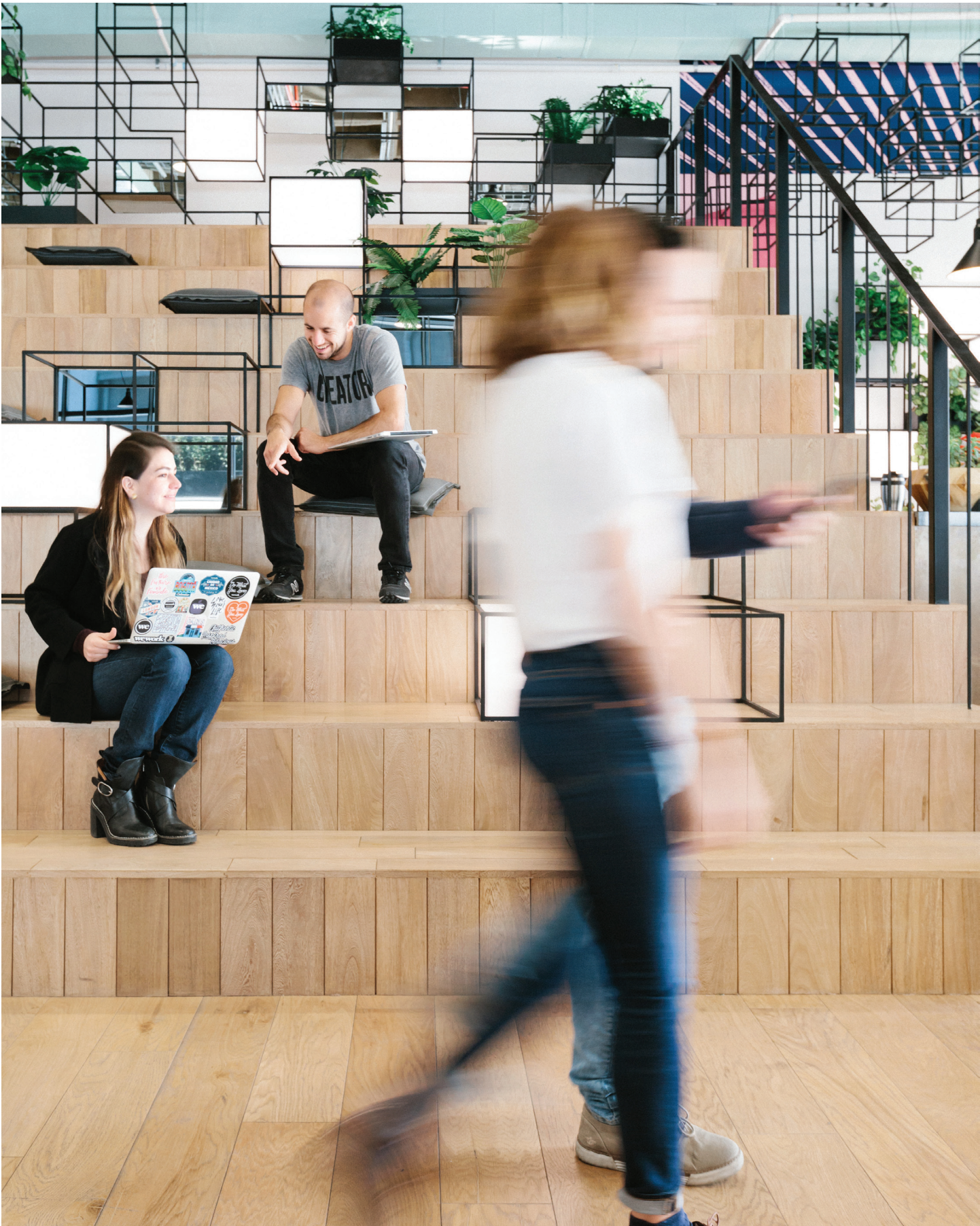
Examples of WeWork spaces