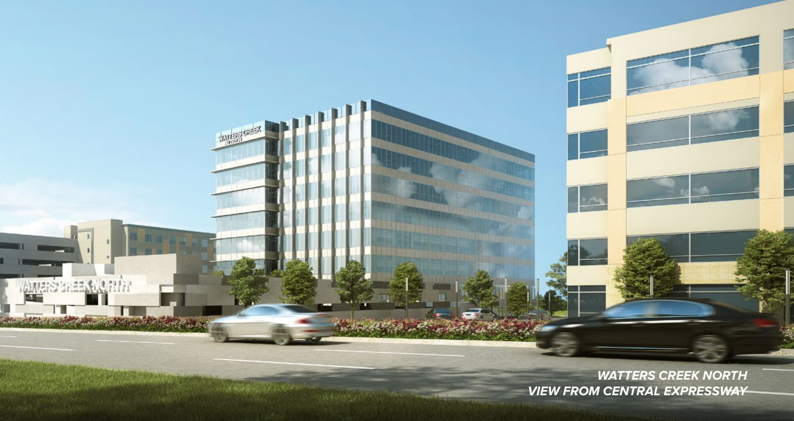
WATTERS CREEK NORTH VIEW FROM CENTRAL EXPRESSWAY