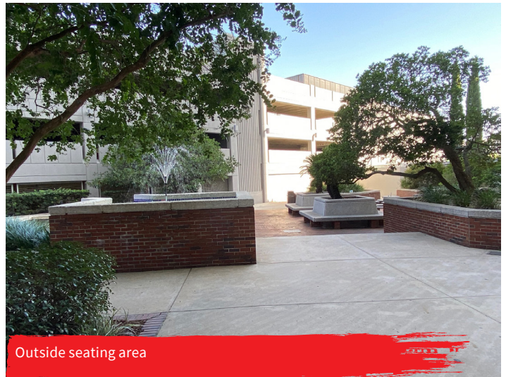
Outside seating area