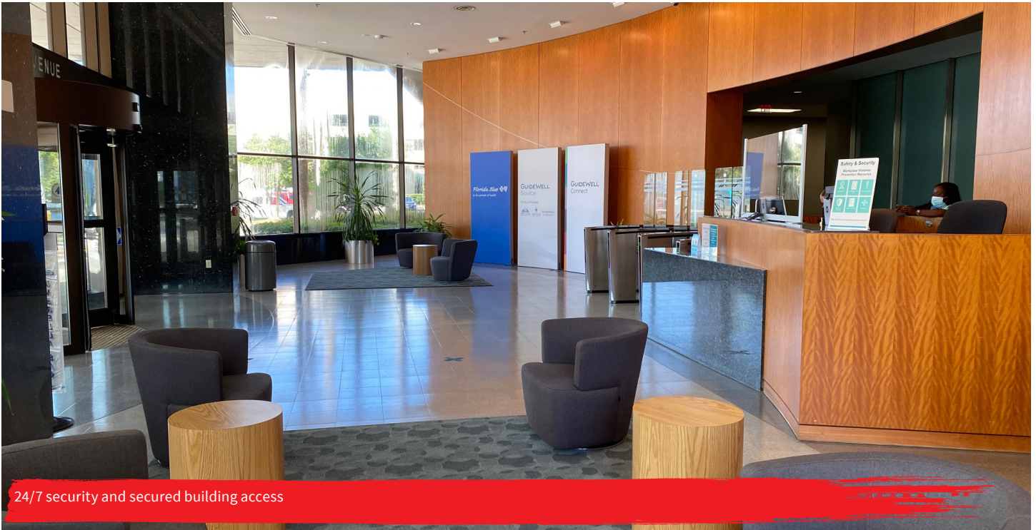
24/7 security and secured building access