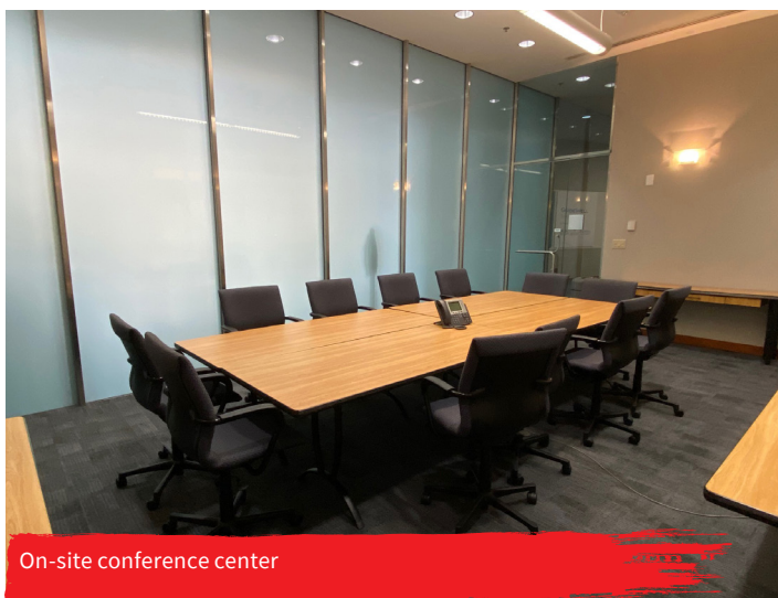
On-site conference center