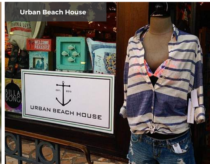
Urban Beach House