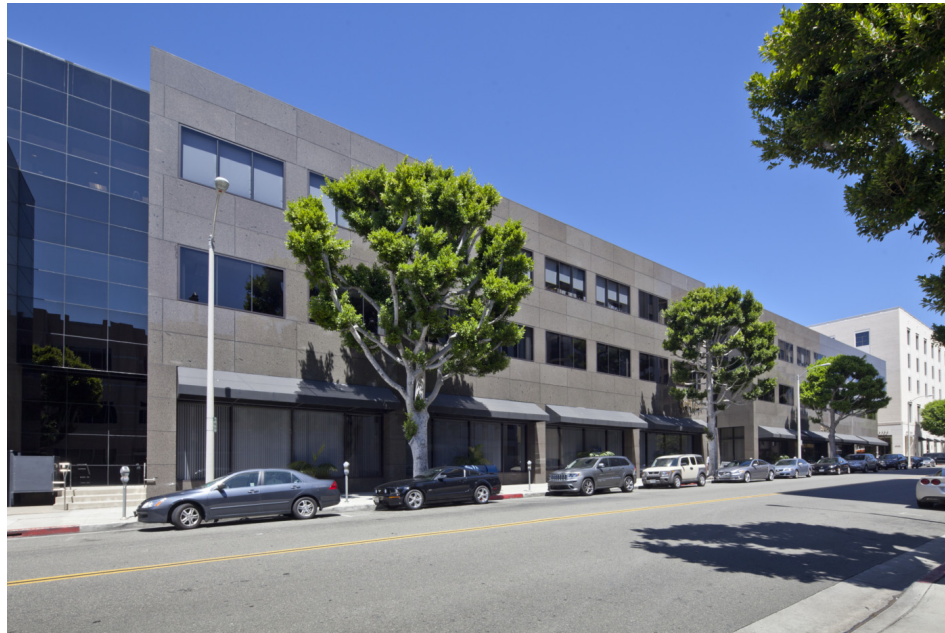
LOOKING NORTH ON RODEO DRIVE