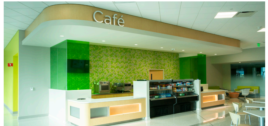
CAFÉ AND DINING AREA