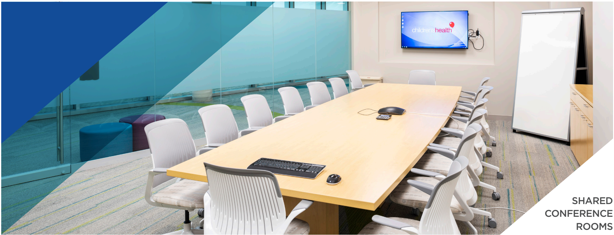
SHARED CONFERENCE ROOMS