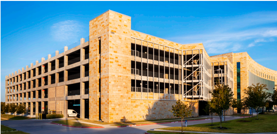
ATTACHED FIVE-STORY PARKING GARAGE