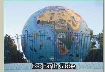
Eco Earth Globe