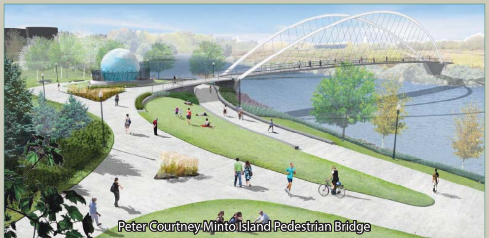
Peter Courtney Minto Island Pedestrian Bridge

Information contained herein has been obtained from the owner of the property or from other sources that we deem reliable. We have no reason to doubt its accuracy, but we do not guarantee it. All information is subject to change without notice.