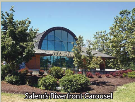
Salem's Riverfront Carousel